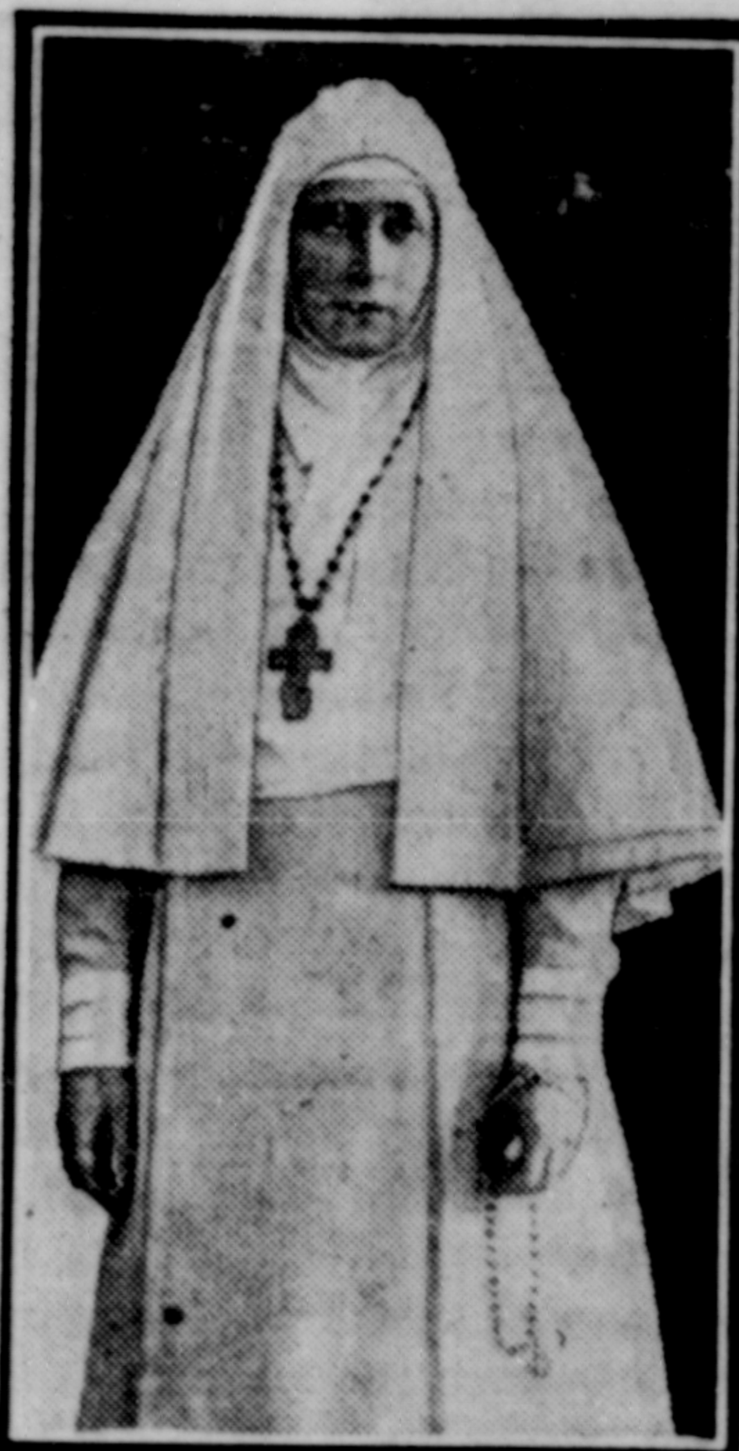
GRAND DUCHESS FEODOROVNA

Rome, Jan. 8.—Turkey is still tardy with regard to the demands of Italy over the Hadeido incident. The Italian government will insist on the release of the British consul, the punishment of the violators of the consulate and a full military salute to the Italian flag. Turkey has been given until January 10 to comply with their demands.