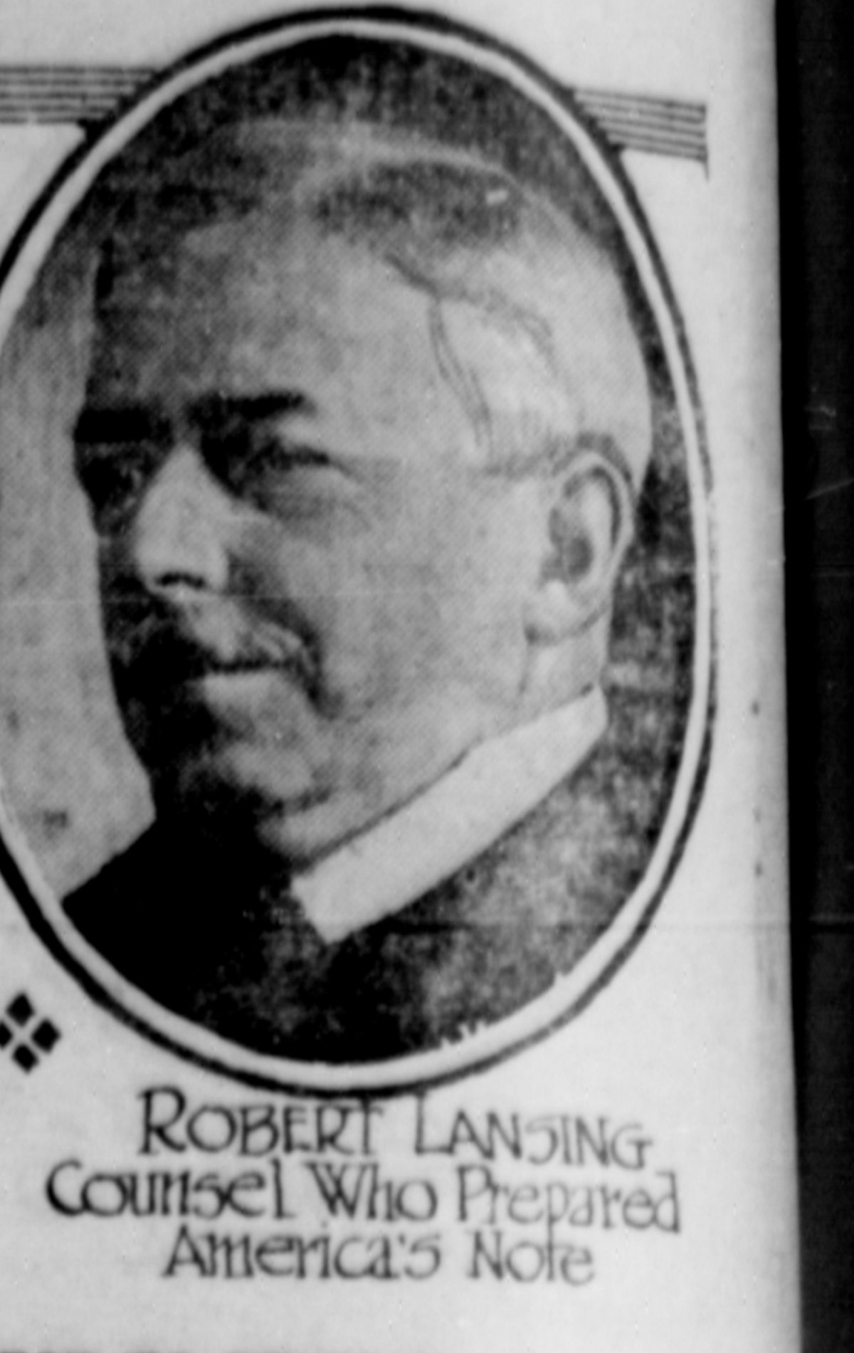
ROBERT LANSING Counsel who Prepared America's Note

PROMINENT FIGURES IN THE RECENT UNITED STATES PROTEST TO BRITAIN —Washington's note, prepared by Robt. Lansing, a Washington counsel, and revised by Secretary of State Bryan and President Wilson, was described as the strongest addressed to any power since the war began. Calm, sound statesmanship on the part of the leading men of both countries has relieved the tension.