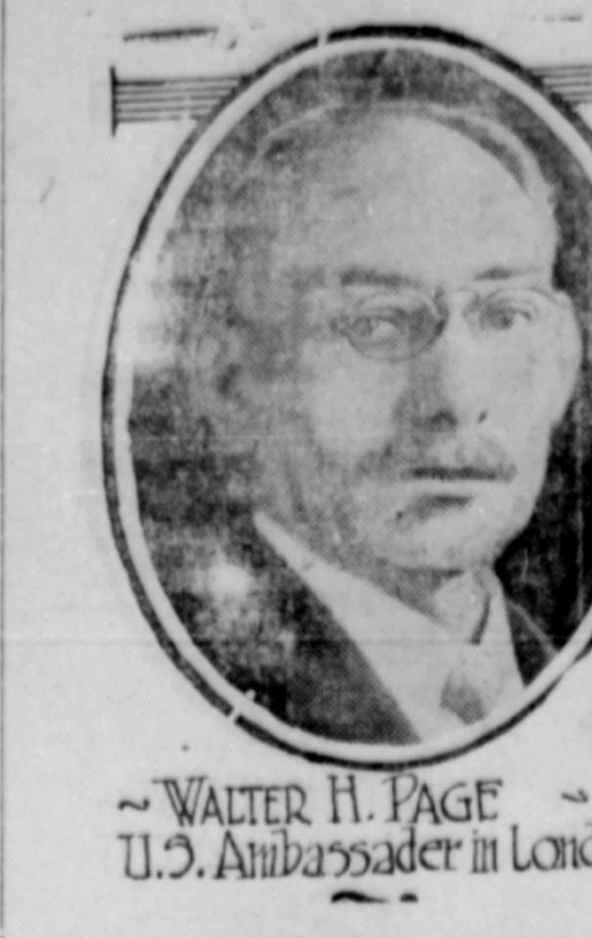
WALTER H. PAGE U.S. Ambassador in London

Ship your FREE FURS Our Trappers Guide Supply Catalog and Price List. Write today, address TO JOHN HALLAM LIMITED TORONTO "Desk E. 18"