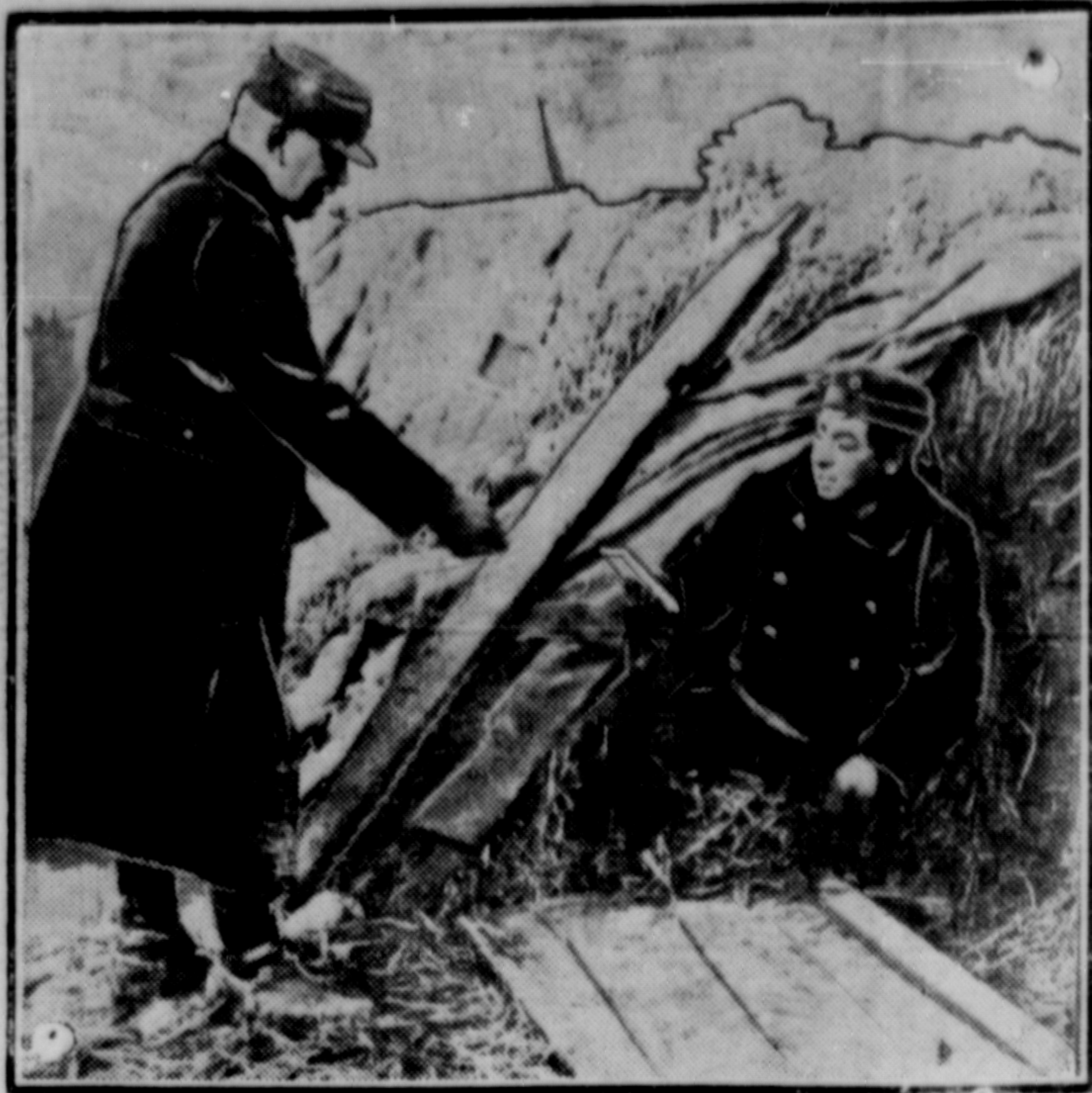
BELGIAN SOLDIERS HAVE SWEET TOOTH. —A Belgian soldier crawling from his bomb-proof shelter in the trenches to receive a packet of chocolate from his commanding officer.

Ship your FURS FREE Our Trappers Guide Supply Catalog and Price List. Write today, address TO JOHN HALLAM LIMITED "Desk E. 18" TORONTO