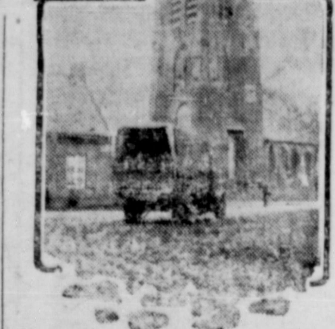
Canadian Staff Headquarters in Northern France.