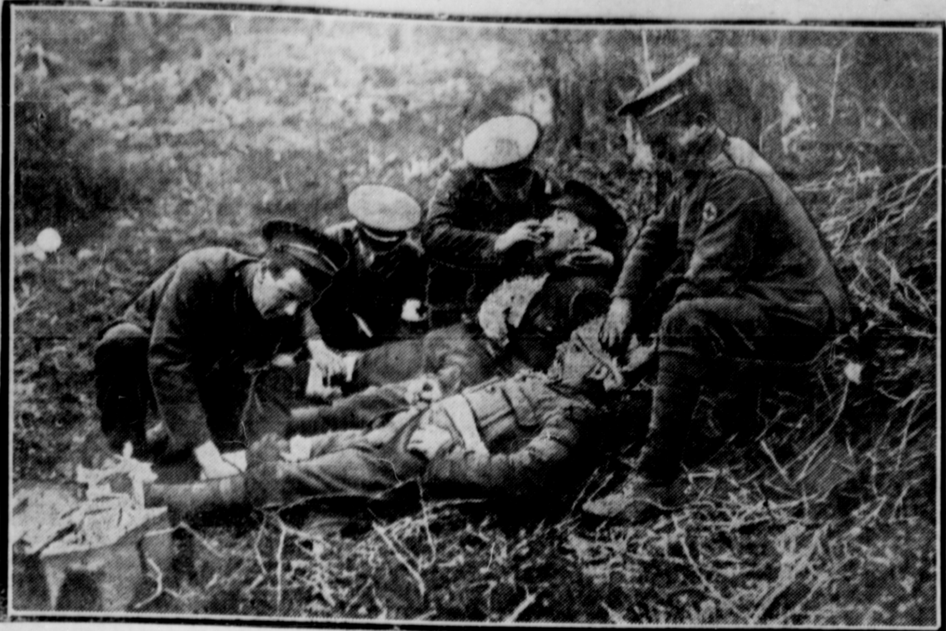
FIRST AID FOR BRITISH WOUNDED BEHIND THE FIRING LINE.

We do the FINEST CUSTOM TAILORING for the LEAST MONEY. We have a large stock of High Class Suits, and make good suits for $27, and the best in stock for $35. Come and look over our stock before buying and save money by it. THIRD AVE and FIFTH ST. Prince Rupert, B. C.