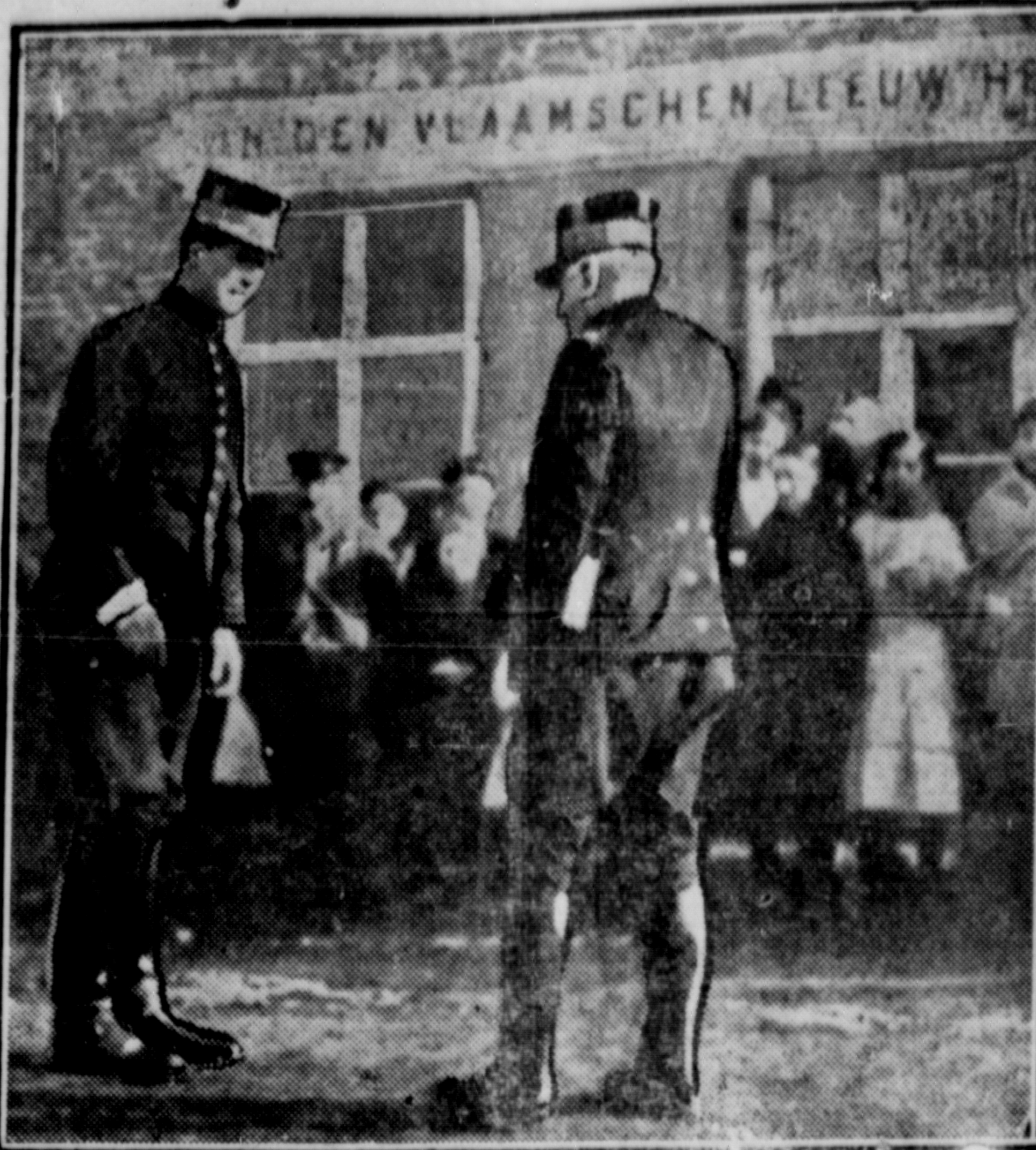
HISTORIC MEETING AT SIGN OF FLEMISH LION.