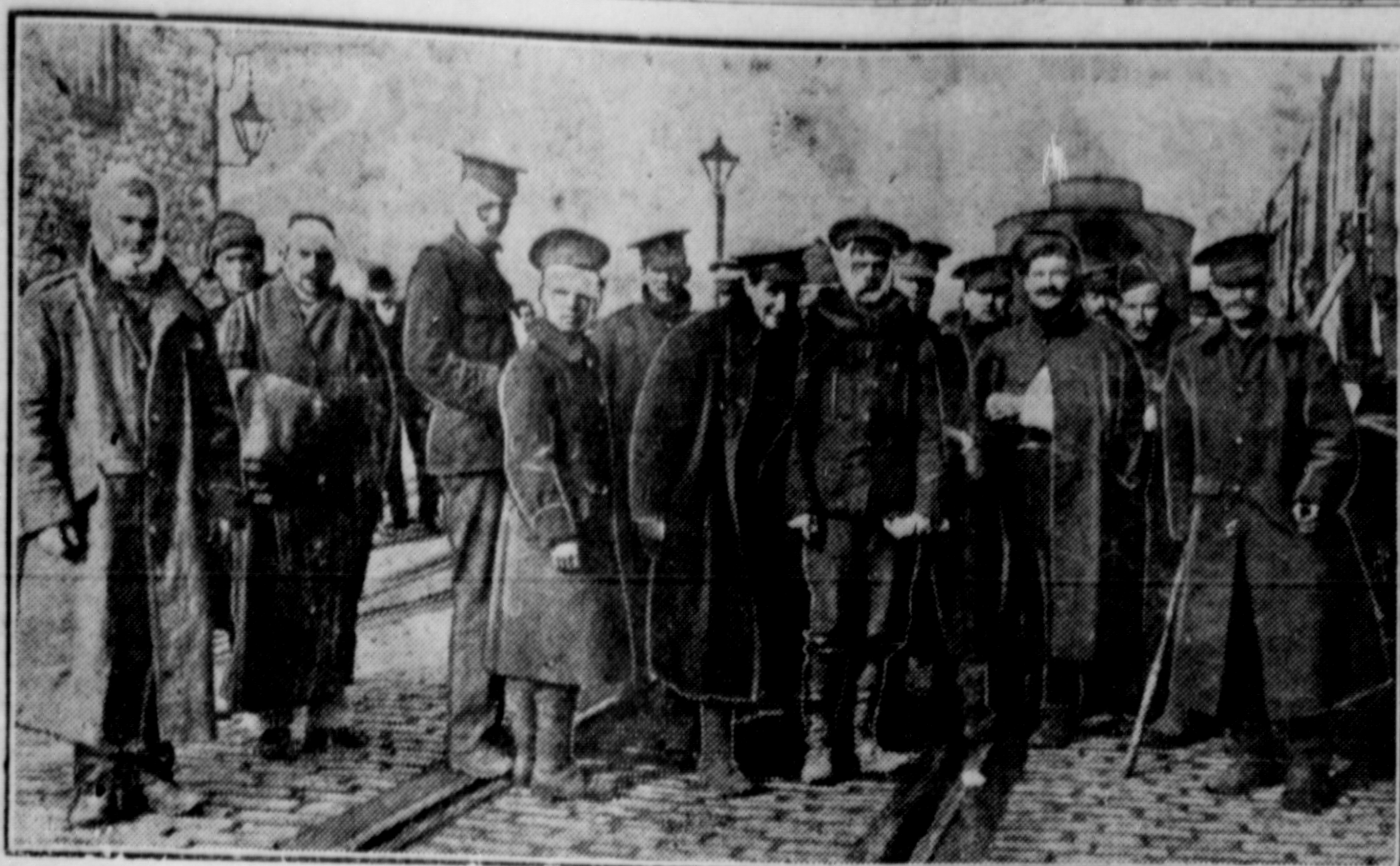
AFTERMATH OF THE BATTLE OF NEUVE CHAPPELLE.

1st Ave. and McBride St. PRINCE RUPERT, B.C. PHONE 25 Branch Yard at Smithers