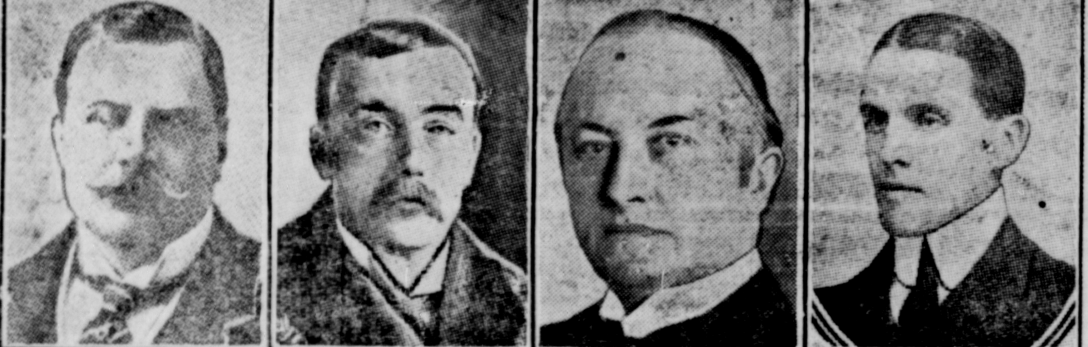
EARL OF DERBY ARTHUR HENDERSON LORD CURZON F. E. SMITH

The above gentlemen were prominently before the public in the recent discussion, prior to the election of the new Coalition cabinet. Austen Chamberlain is the new Secretary of State for India; A. Bonar Law is Secretary for the Colonies; Lord Reading, better known as Sir Rufus Isaacs, remains Lord Chancellor; A. J. Balfour is now First Lord of the Admiralty; the Earl of Derby has been prominent in recruiting work; Arthur Henderson is the able Labor leader; Lord Curzon was formerly viceroy of India, and Sir F. E. Smith is the new Solicitor General.