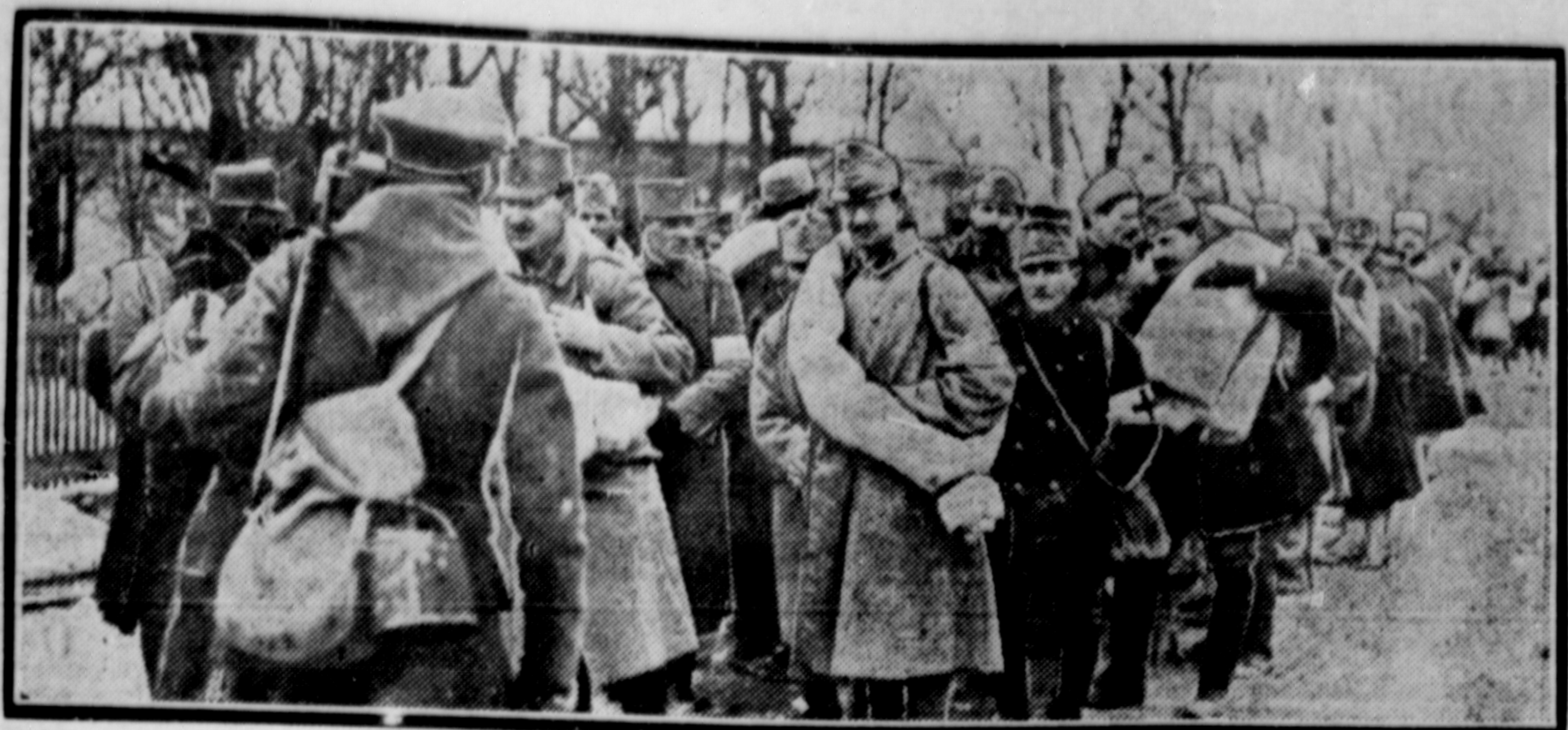
AUSTRIAN PRISONERS FROM PREM YSL.