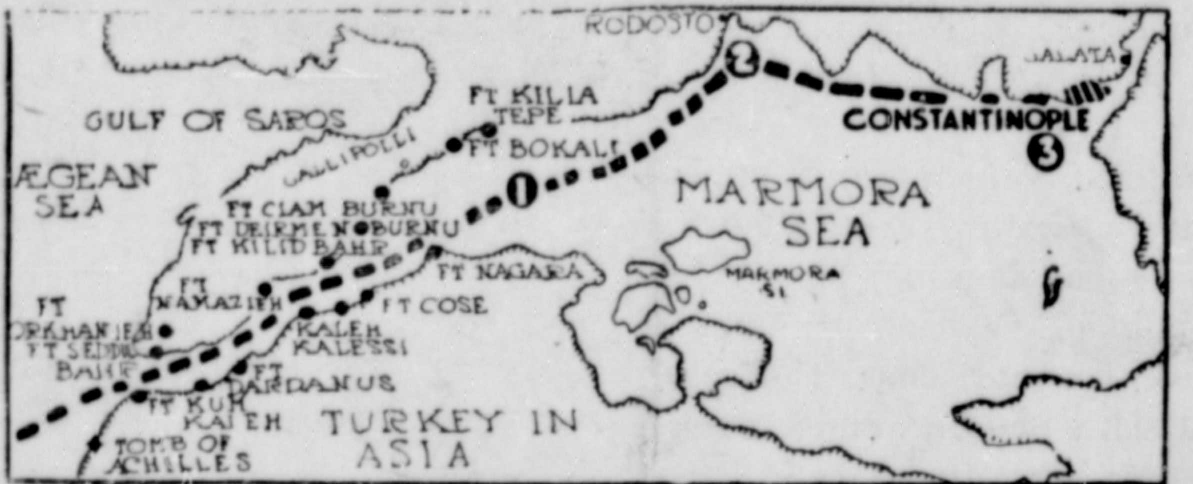
EXPLOIT OF BRITISH SUBMARINE E-11 —The E-11 penetrated the Dardanelles to the Sea of Marmora. There it (1) torpedoed and sunk a vessel carrying a great quantity of ammunition; (2) torpedoed a ship carrying war stores at Rodosto, and ran another supply ship ashore; (3) entered Constantinople harbor and hit a transport with a torpedo.