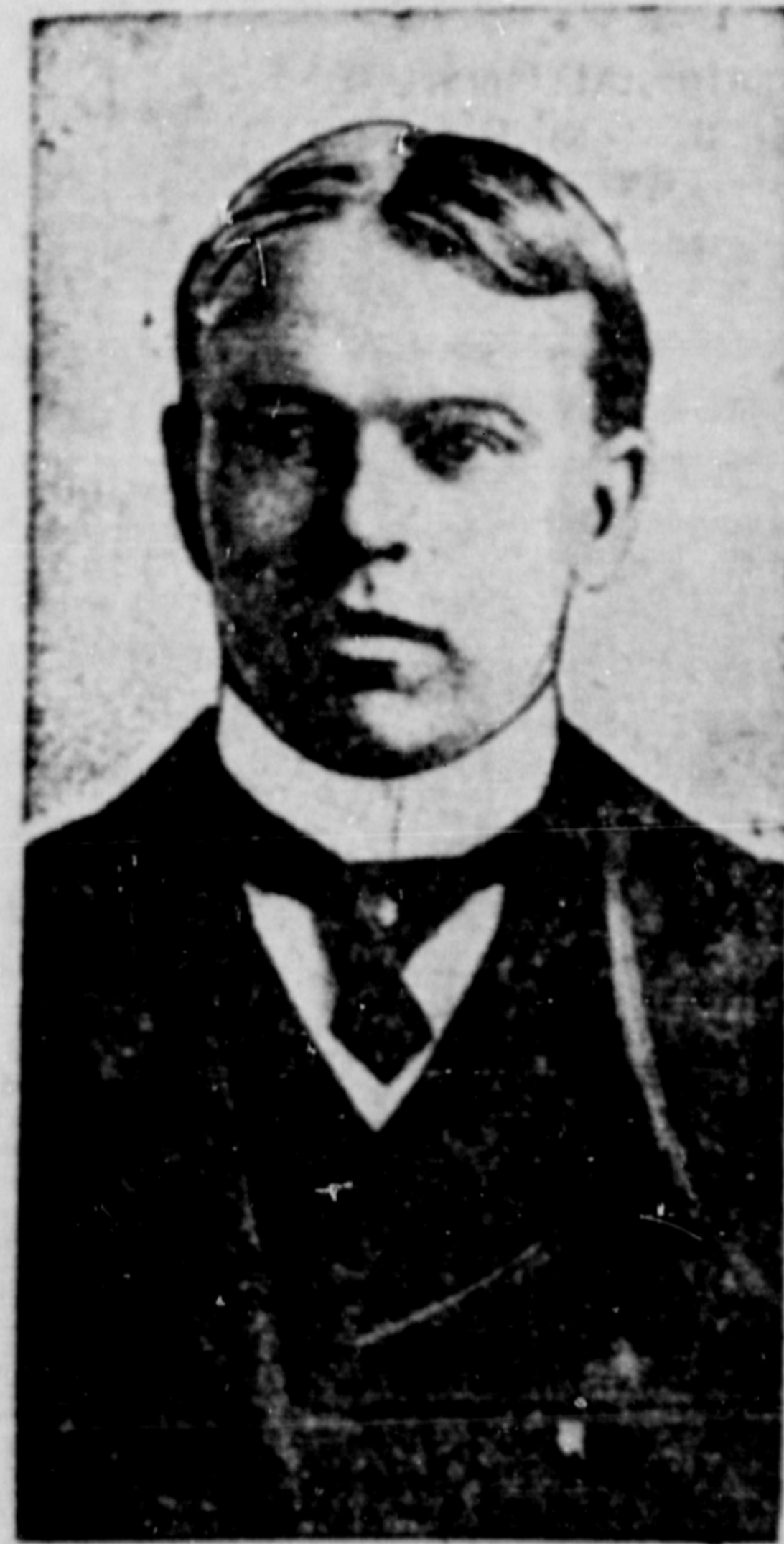
W. L. MACKENZIE KING Leader of Opposition in Parlia- ment, who is to visit Prince Rup- ert this summer.