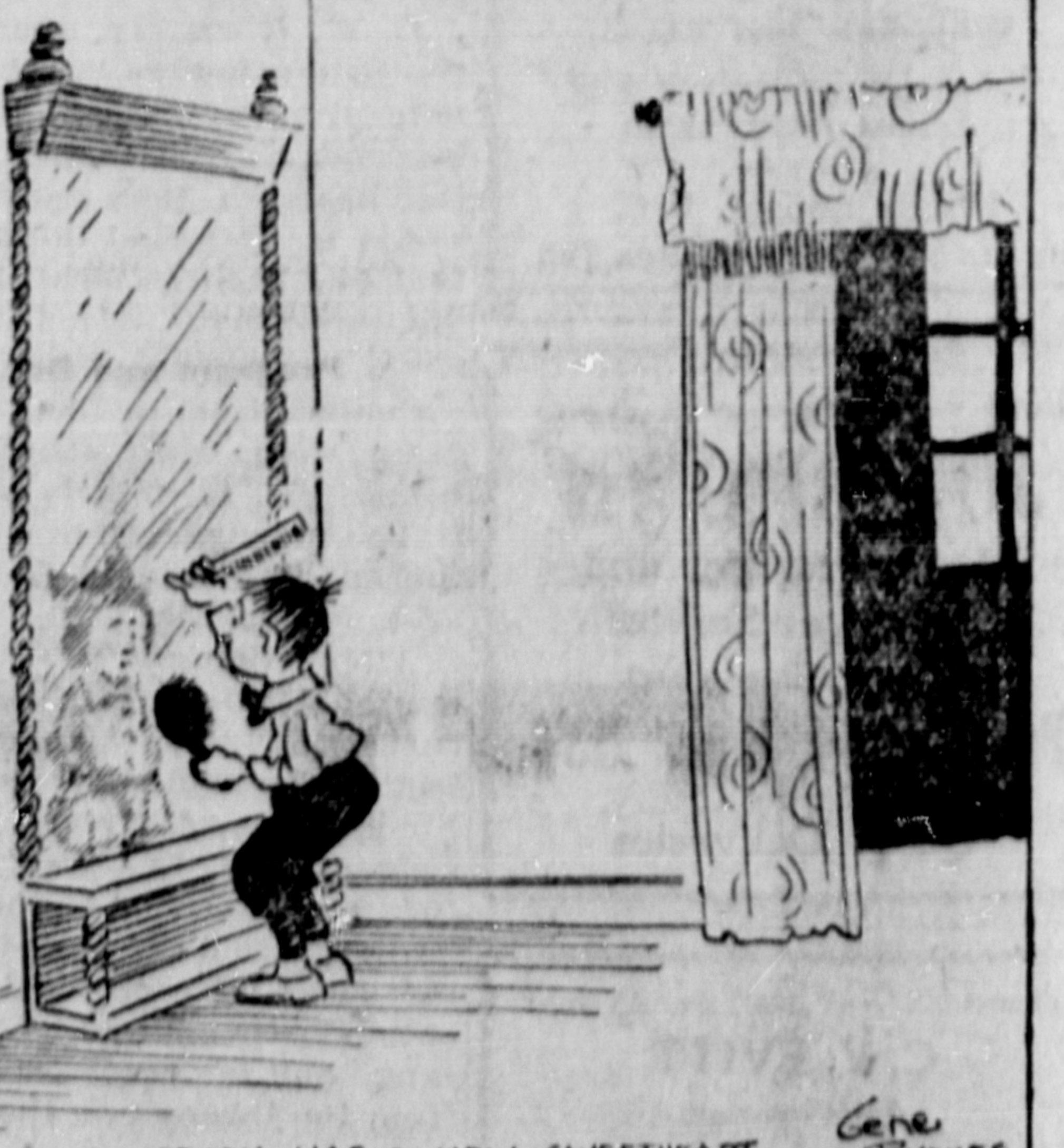
SOMEBODY HAS A NEW SWEETHEART