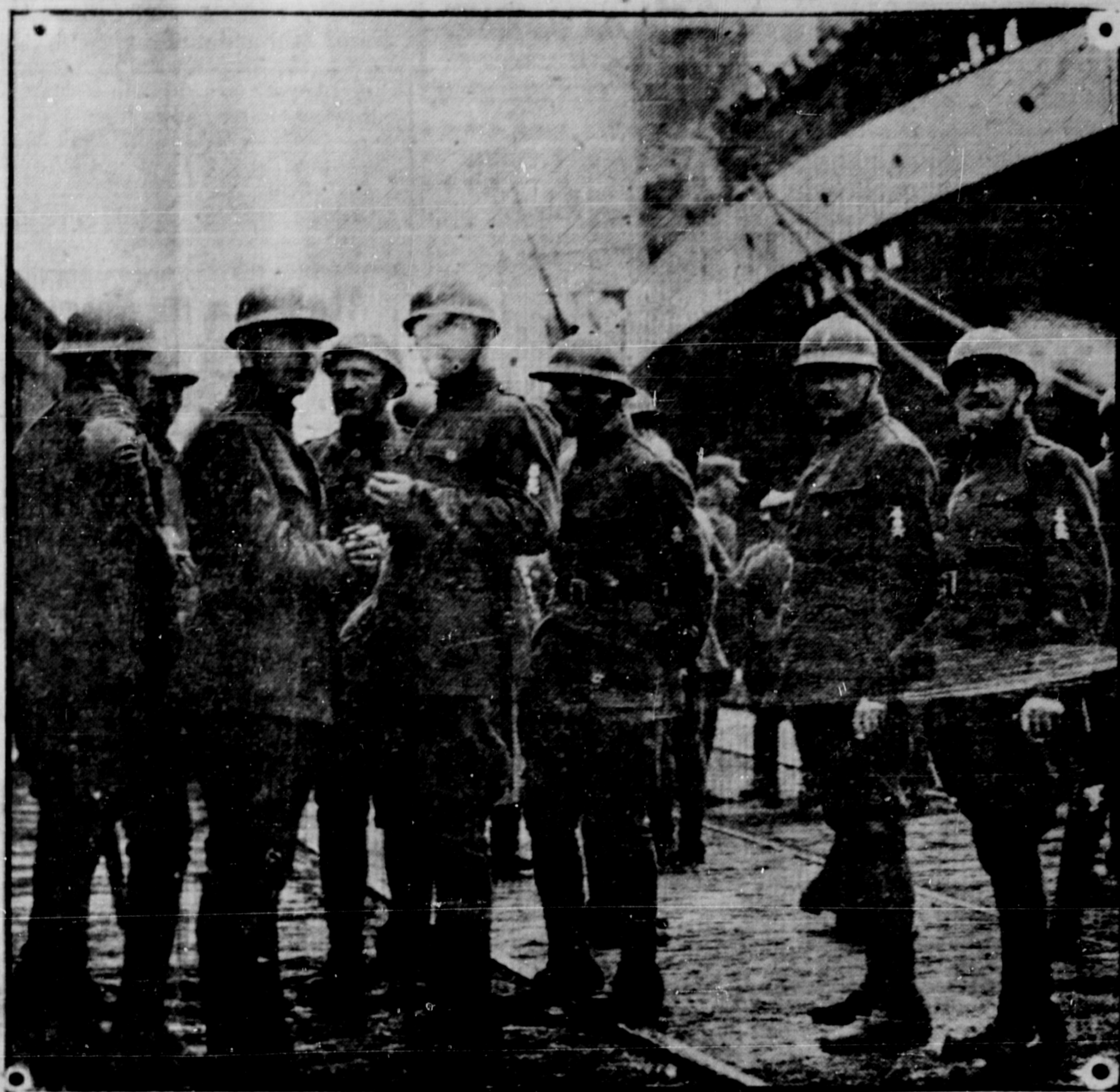
Photograph shows the first contingent of nearly 3,000 of 30,000 Czechoslovak troops now at Vladivostok, on arrival aboard the Ixion at the Evans, Coleman and Evans wharf, Vancouver, recently, and who have just reached their home in Czechoslovakia.