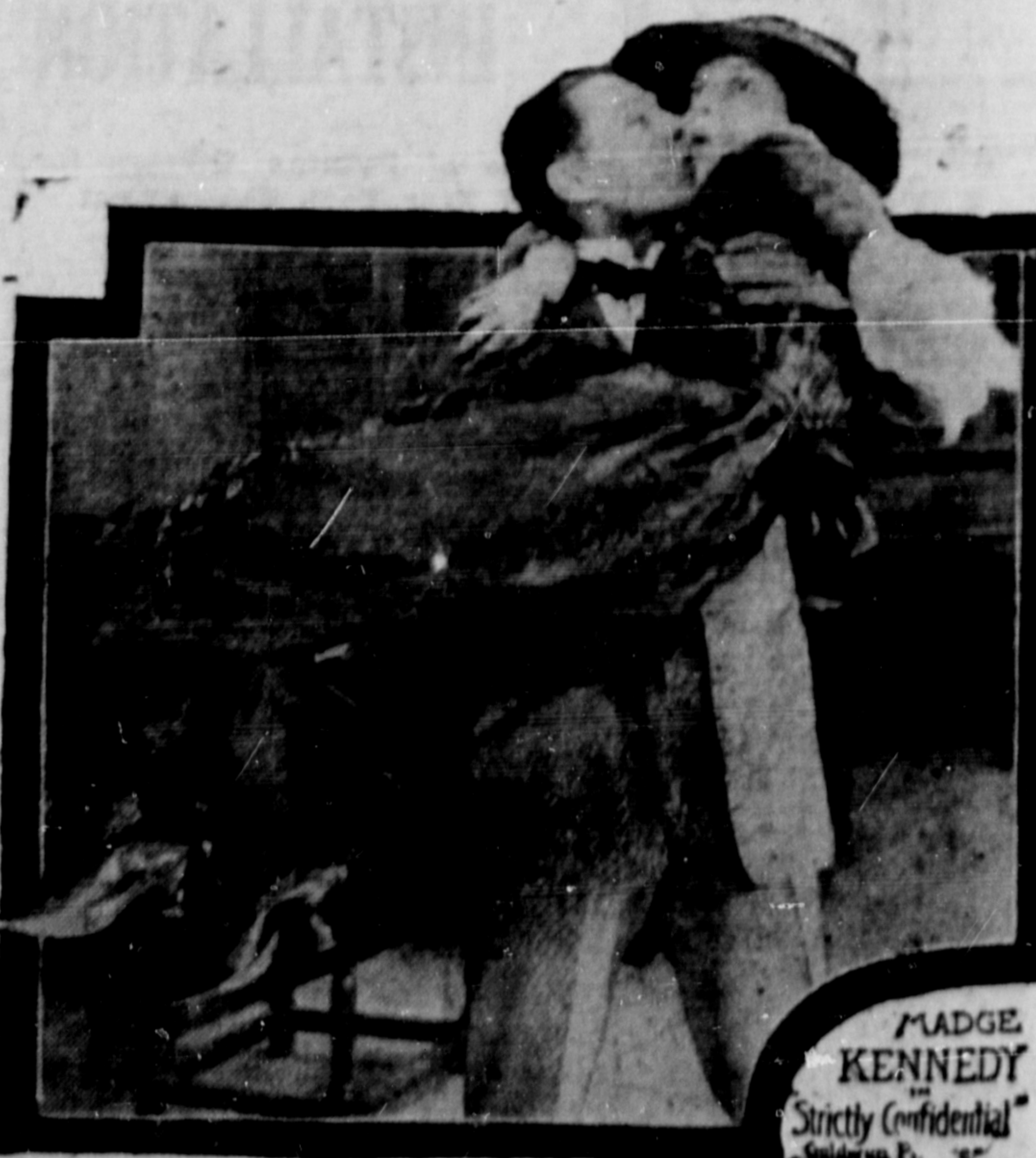
Starring tonight at the Westholme Theatre.

"Colonel He's a Liar's Waterloo" Pictorial