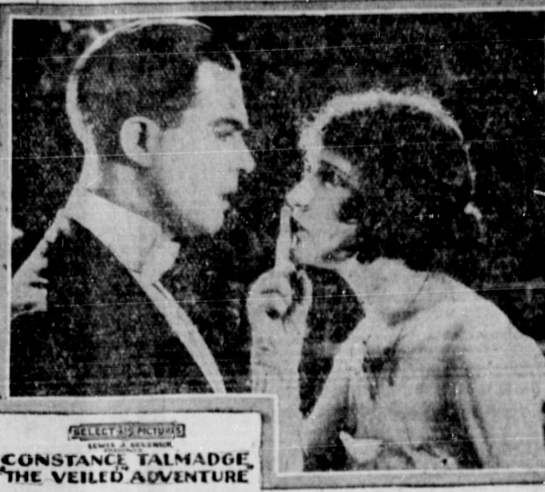
CONSTANCE TALMADGE, 'THE VEILED ADVENTURE'