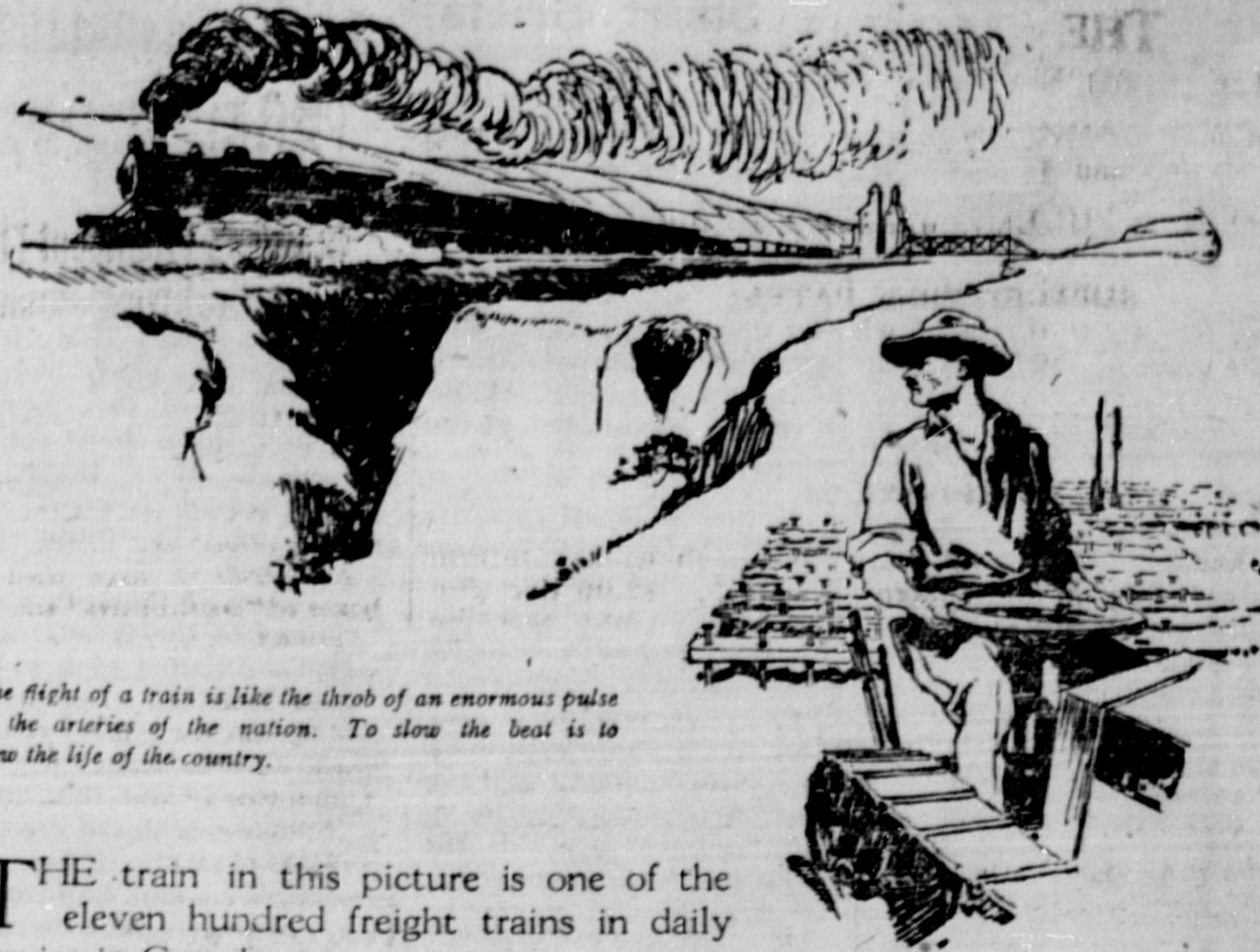
The flight of a train is like the throb of an enormous pulse in the arteries of the nation. To slow the beat is to slow the life of the country.

Deputy Minister of Lands, Lands Department, Victoria, B. C., 5th May, 1920.