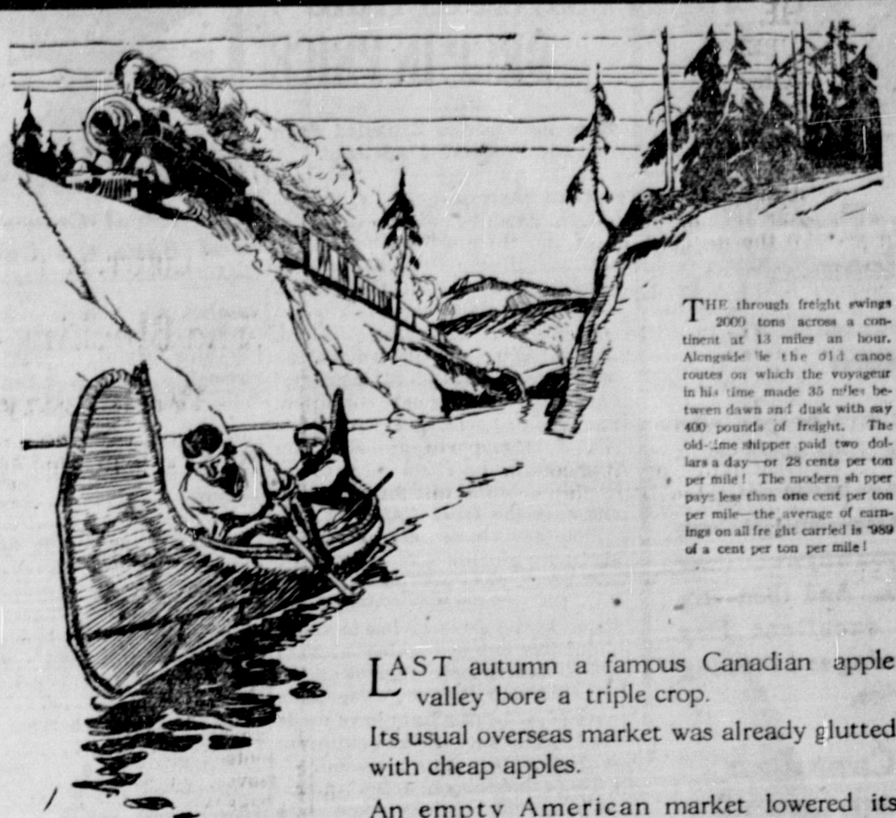
THE through freight swings 3000 tons across a continent at 13 miles an hour. Alongside the old canoe routes on which the voyager tows down and dunks with 400 pounds of freight. The old-time shipper paid two dollars a day—or 28 cents per ton per mile! The modern shipper pays less than one cent per ton per mile—the average of earnings on all freight carried is 989 of a cent per ton per mile!

A True Nature Treatment. Ask your druggist for a copy of "The Road to Health." It tells the real facts about herb remedies—gives the actual experience of those who have used Wonder Health Restorer. Sole Sale in Prince Rupert by Prince Rupert Drug Co