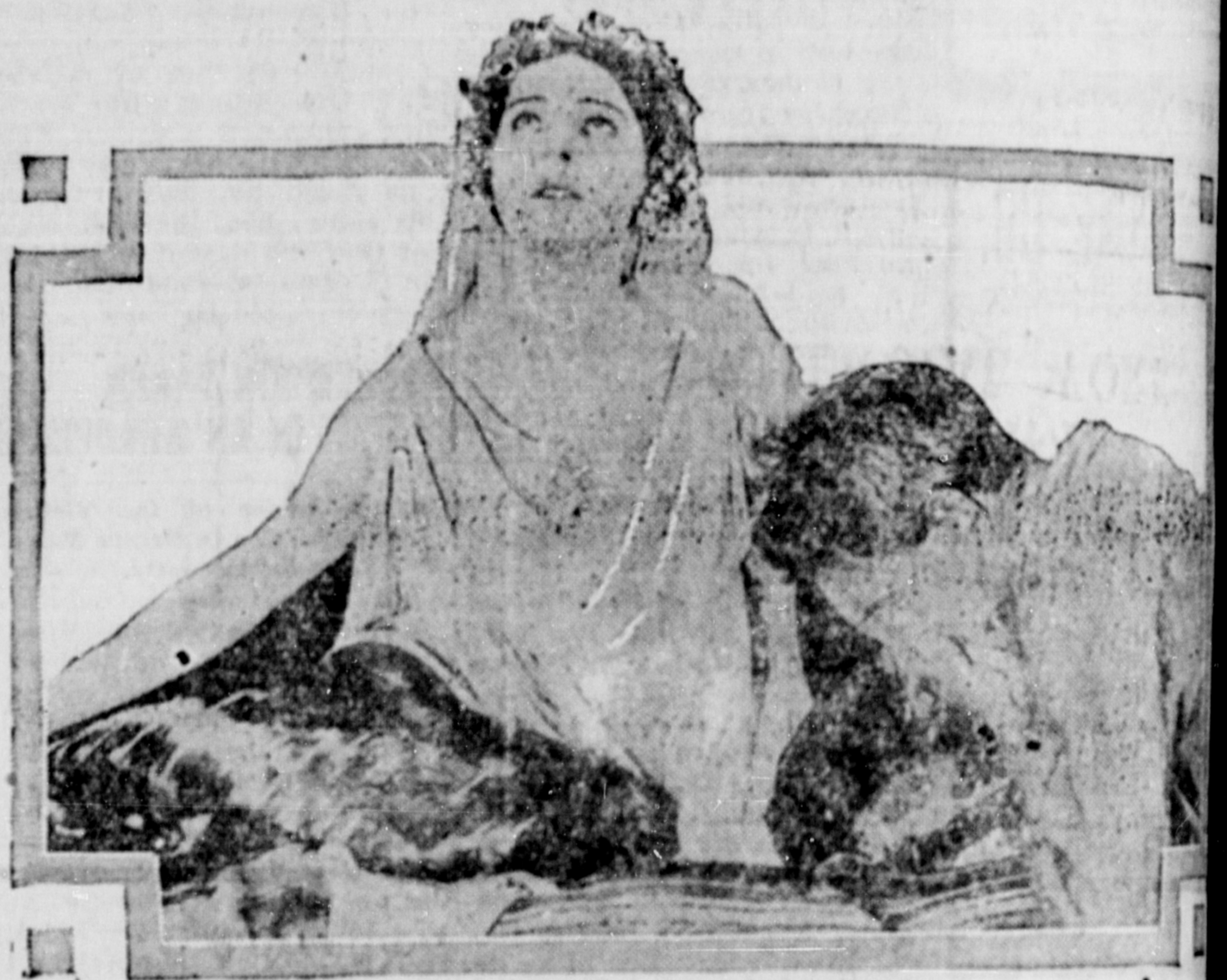
NAZIMOVA IN "STRONGER THAN DEATH"

Adapted by Charles Bryant from the Novel of Anglo-Indian life by I. A. R. Wylie.