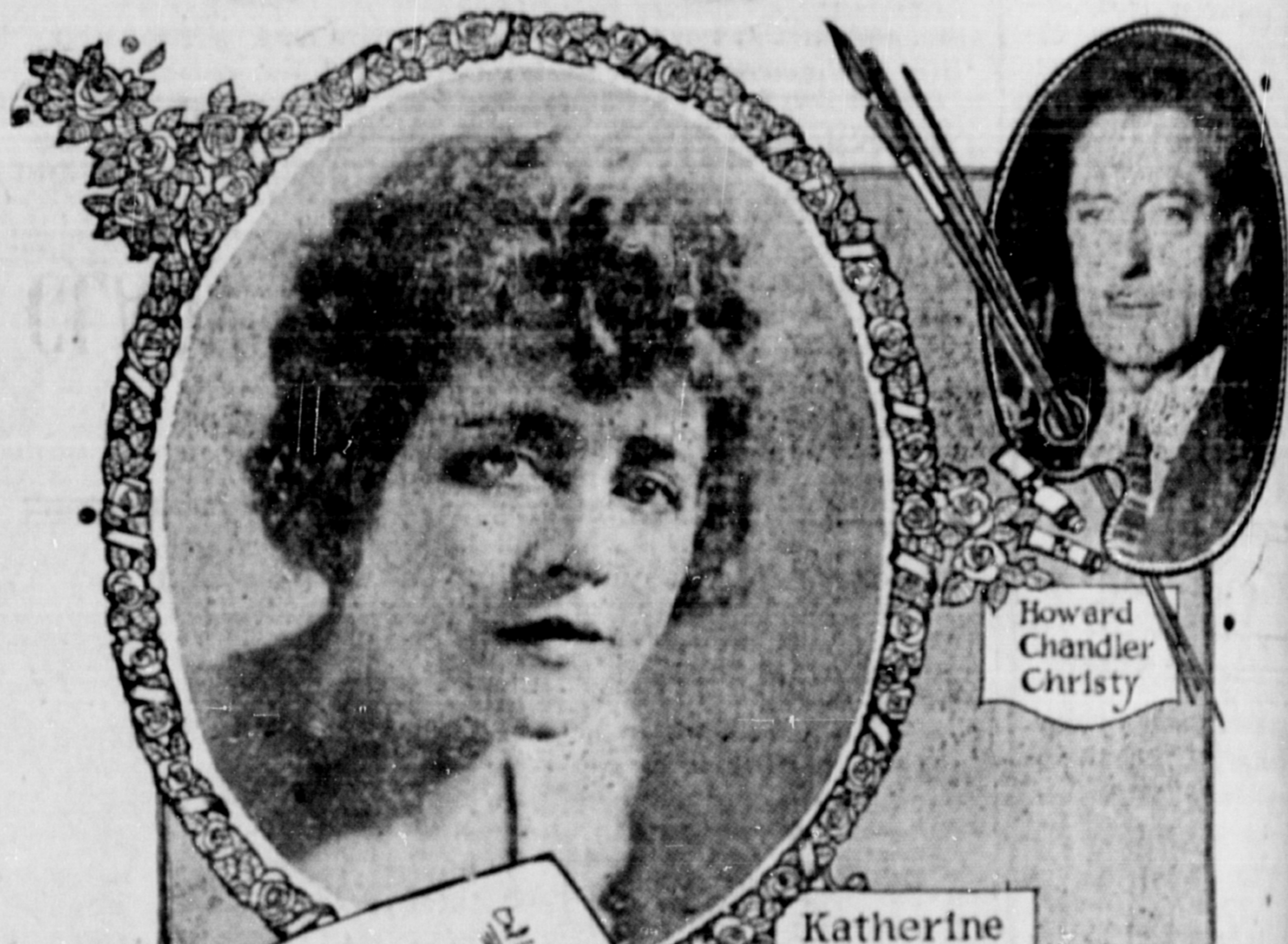
Howard Chandler Christy