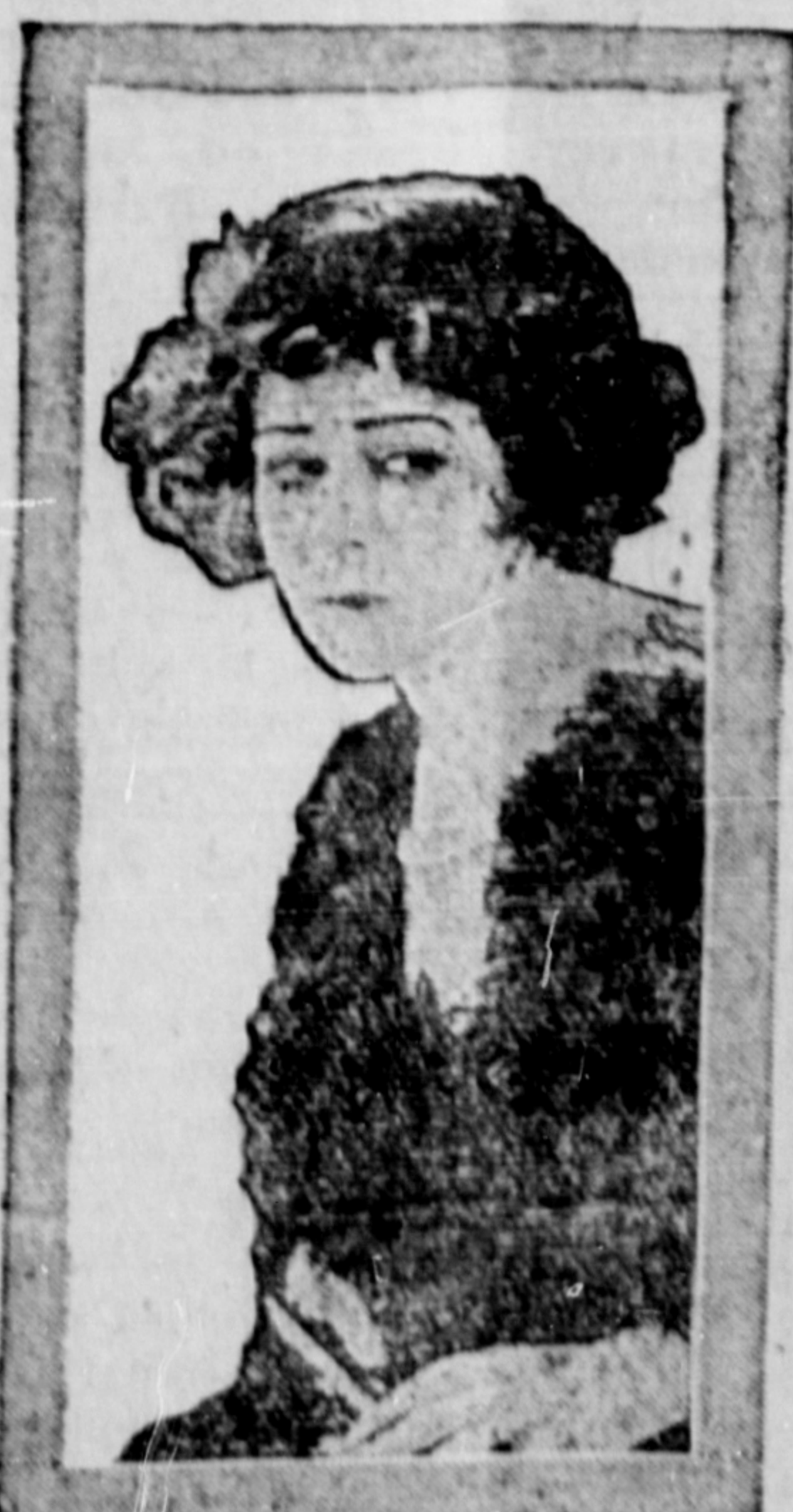
NAZIMOVA in 'THE BRAT'

The King & Winge has arrived with 80,000 pounds for the National Independent Company.