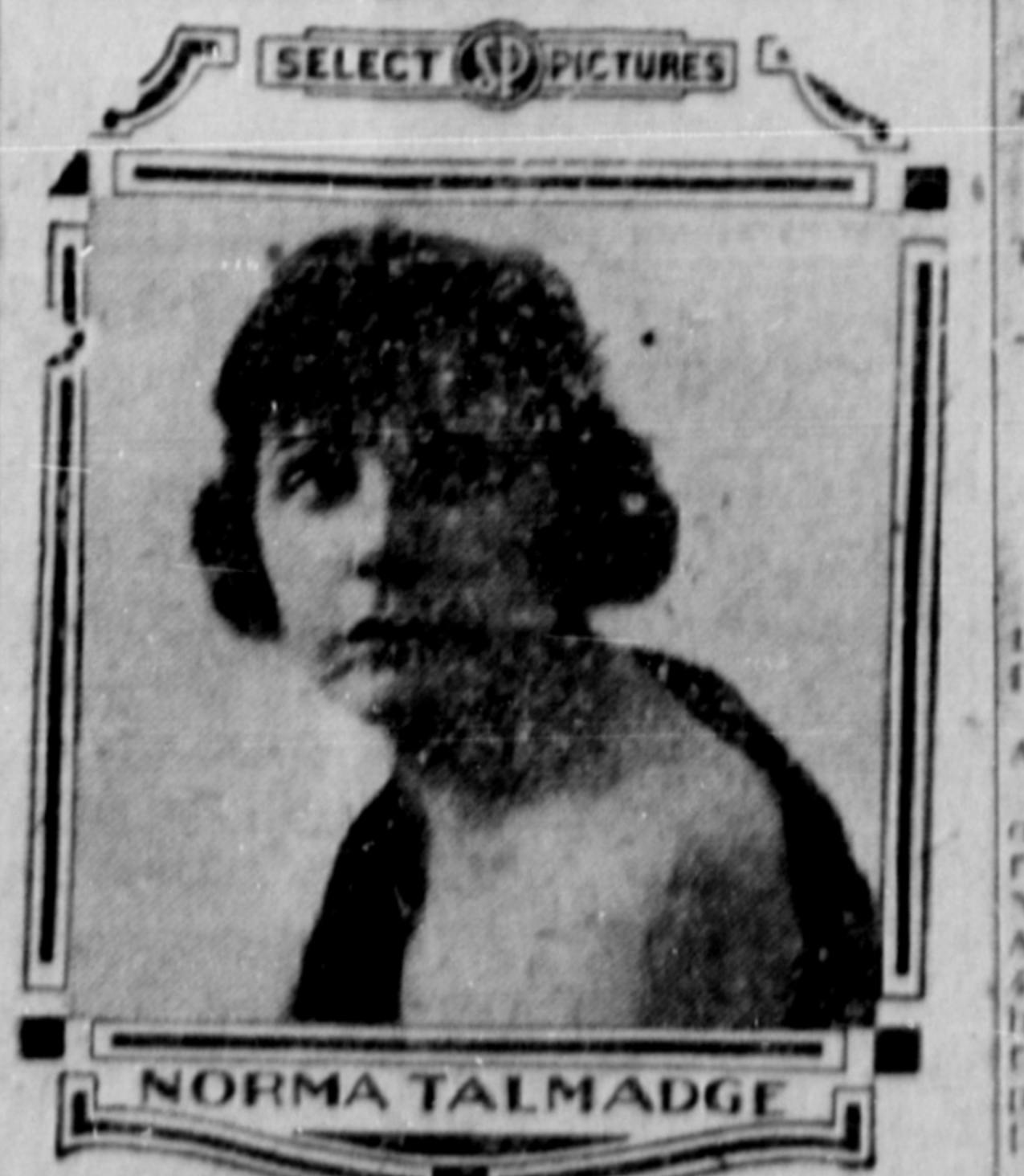
Starring at the Empress Theatre Tonight