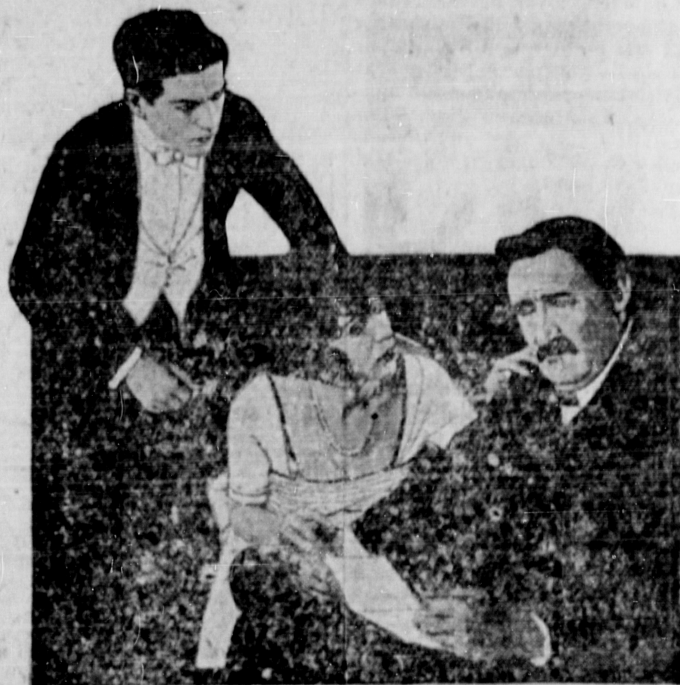
Mabel Normand in "Pinto" GOLDWYN PICTURES

A mile a minute comedy drama that will please everybody.