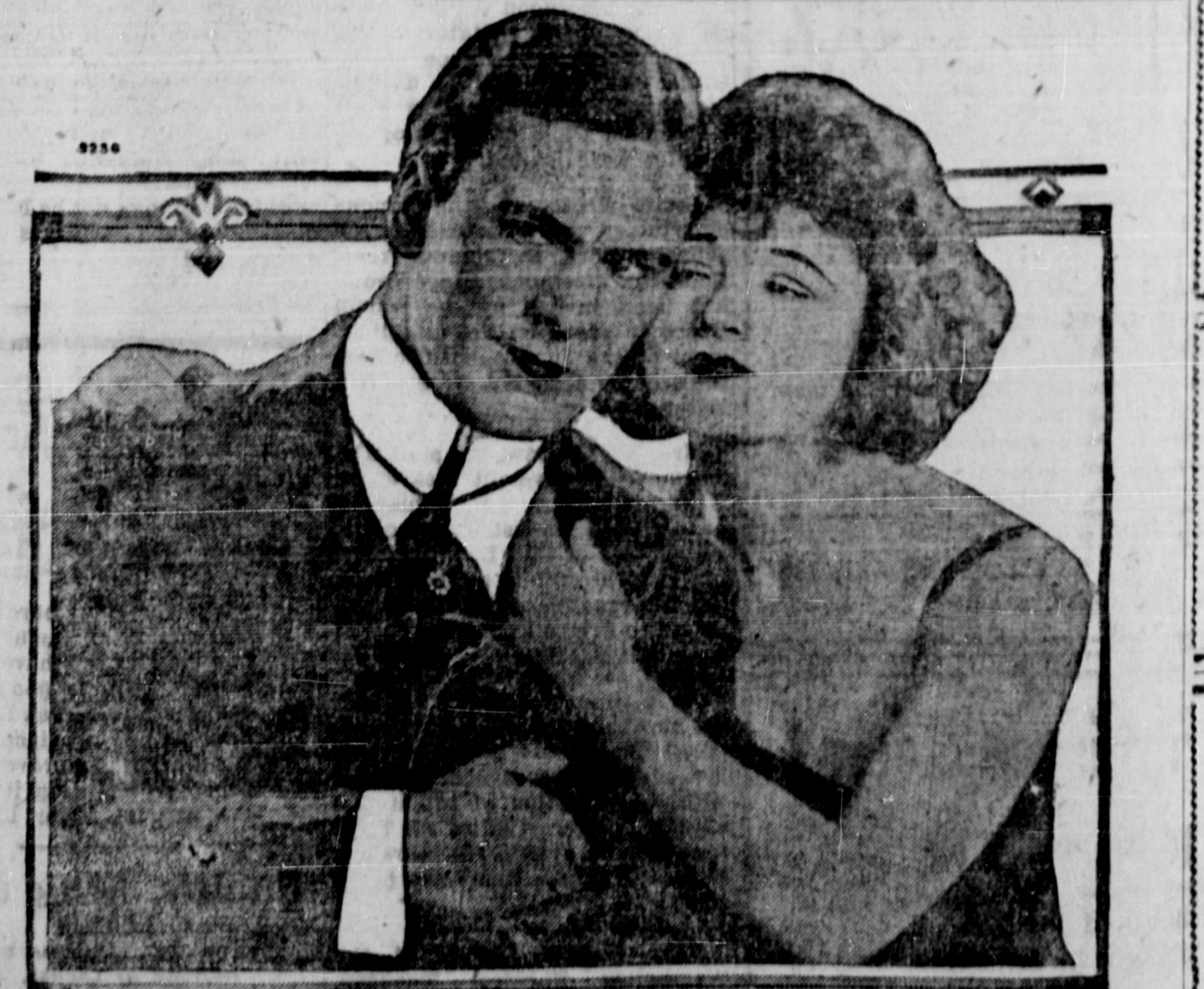
"The Miracle Man" at the Westholme Theatre Friday and Saturday