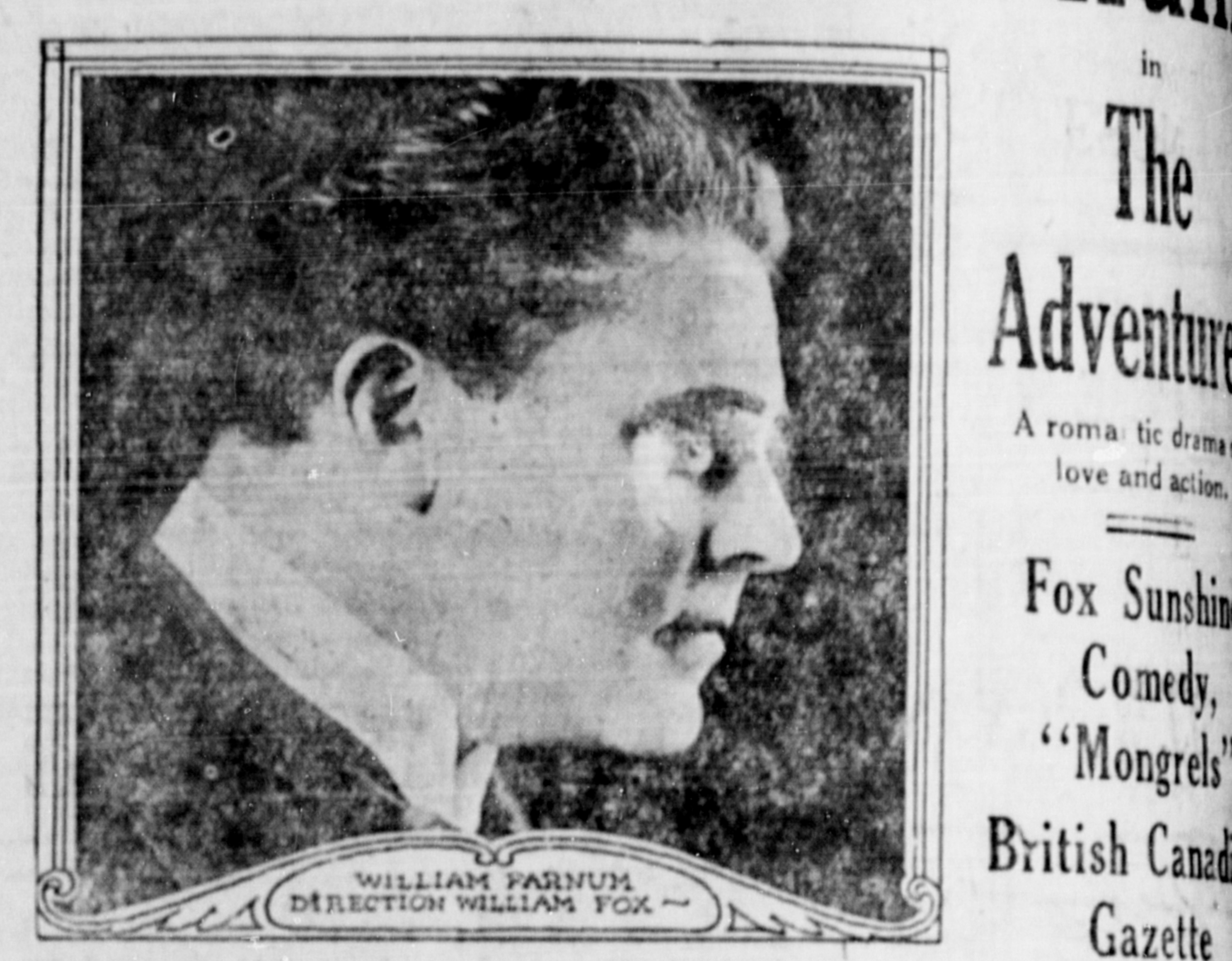
WILLIAM FARNUM DIRECTION WILLIAM FOX

The Adventure A romantic drama of love and action. Fox Sunshine Comedy, "Mongrels" British Canadian Gazette