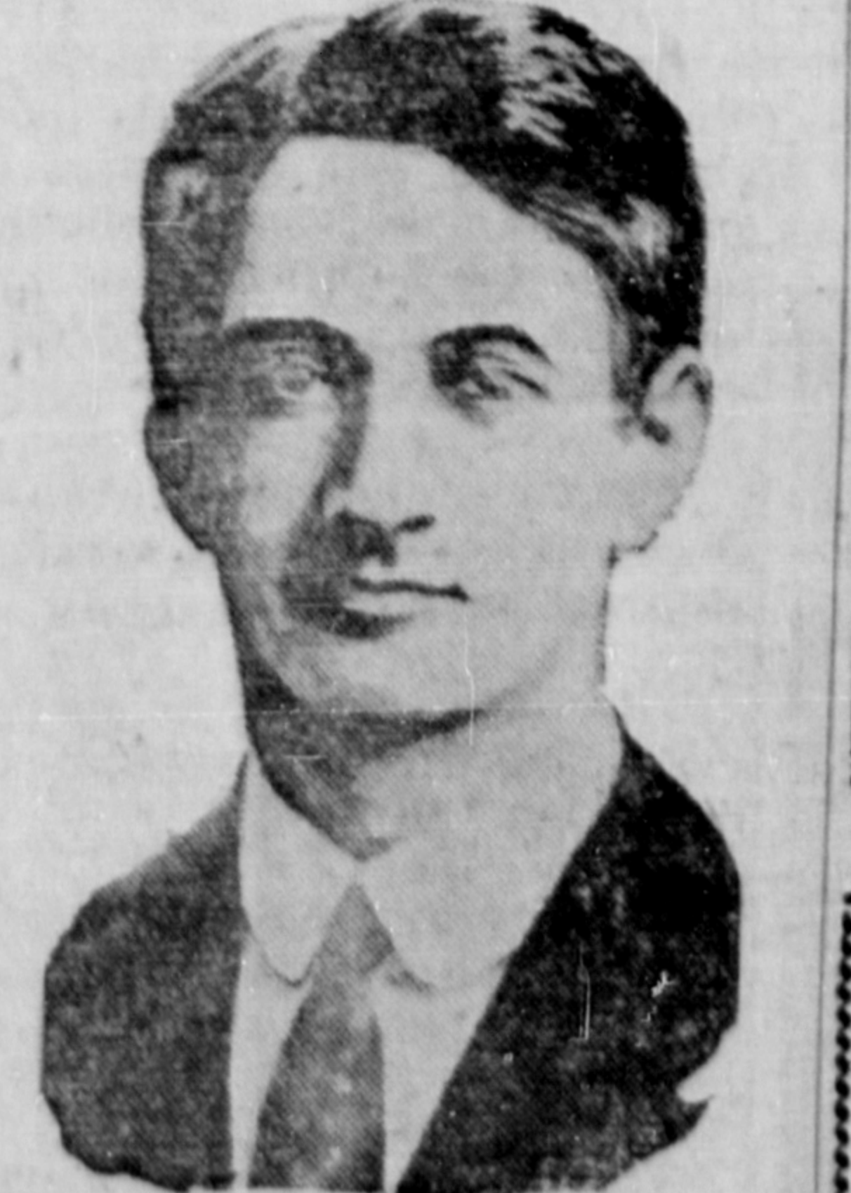
Lord Mayor McSweeney of Cork, Ireland, who after a prolonged illness succumbed to a prolonged hunger strike.