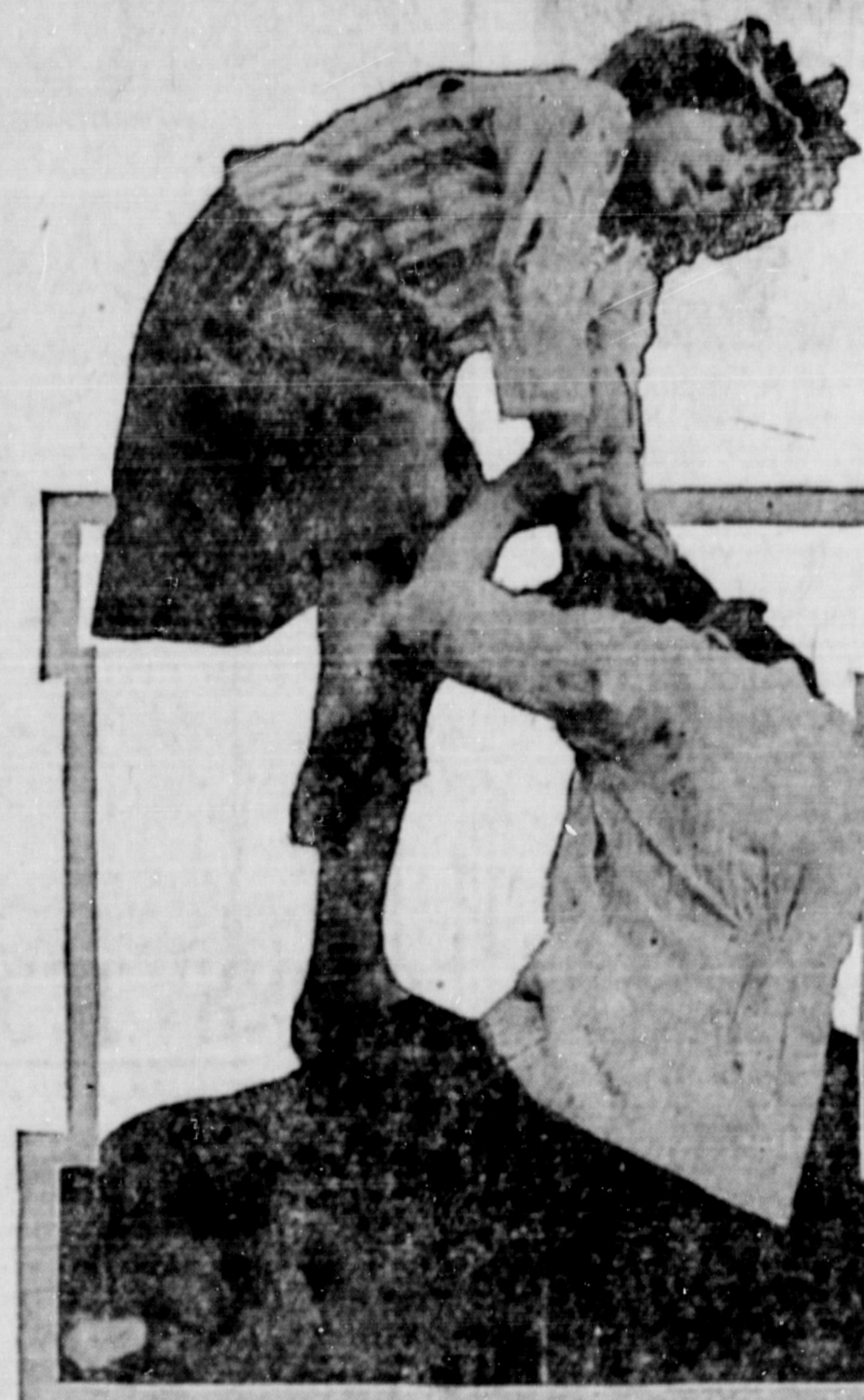
NAZIMOVA in "THE HEART OF A CHILD"

The Greatest Play of the Season. The Emotional Actress