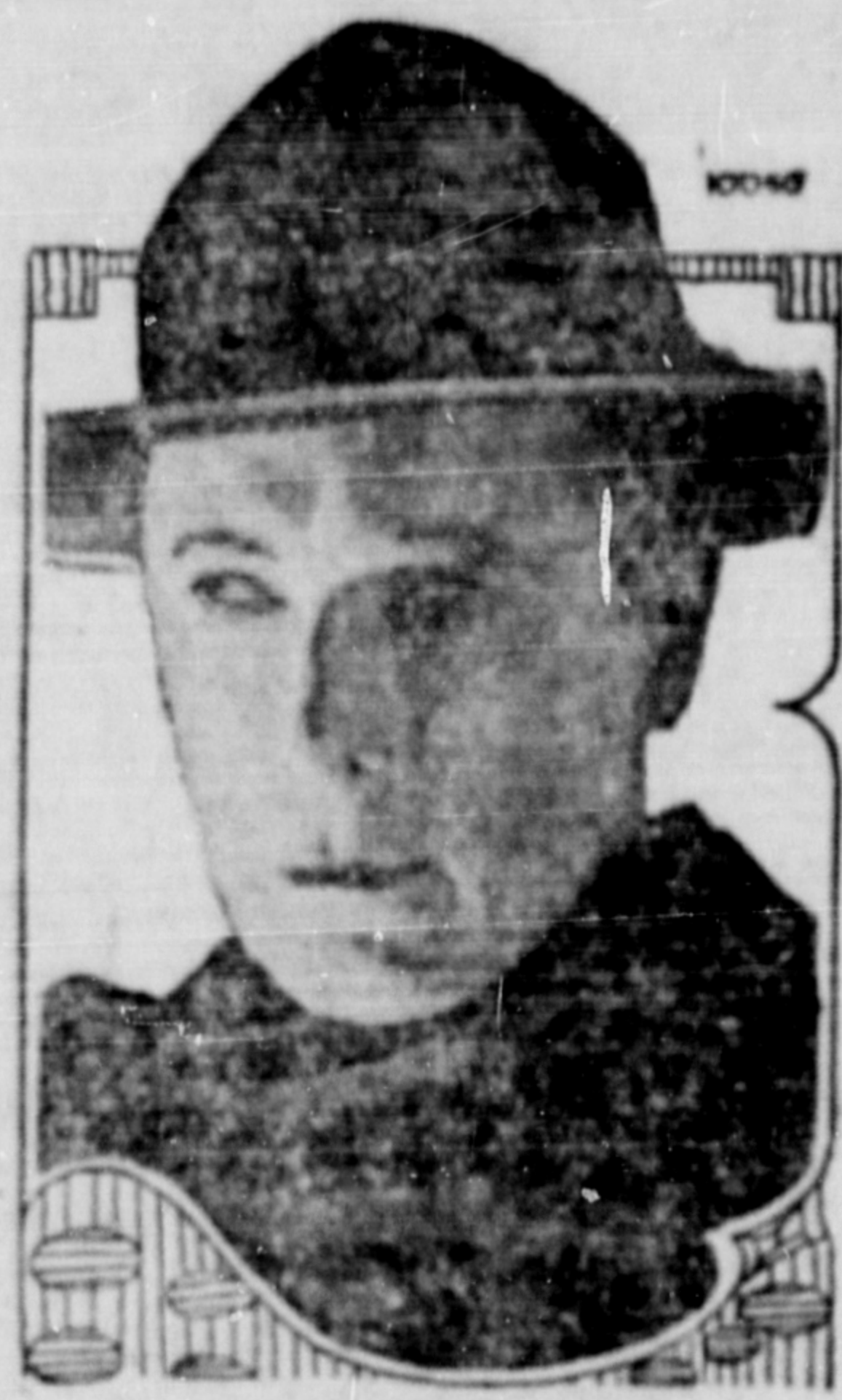
WILLIAM S. HART in "THE TOLL GATE" A PARAMOUNT AIRCRAFT PICTURE