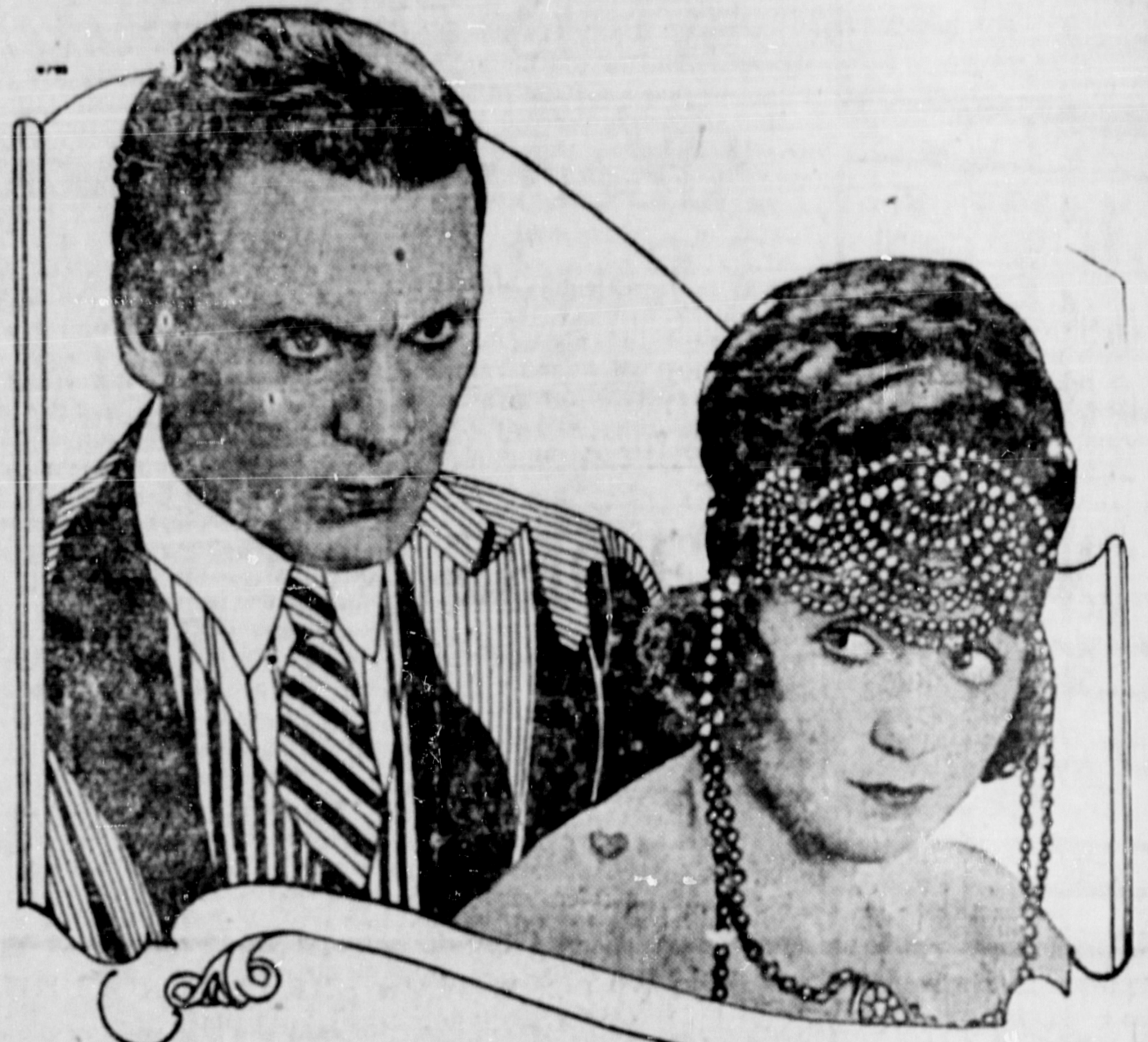
THOMAS MEIGHAN and BEBE DANIELS in a scene from CECIL B. DE MILLE'S PRODUCTION 'WHY CHANGE YOUR WIFE?' A PARAMOUNT ARTICRAFT PICTURE

Surpasses all the previous Cecil B. DeMille productions, with famous star cast as THOMAS MEIGHAN, BEBE DANIELS, GLORIA SWANSON, THEODORE KOZLOFF