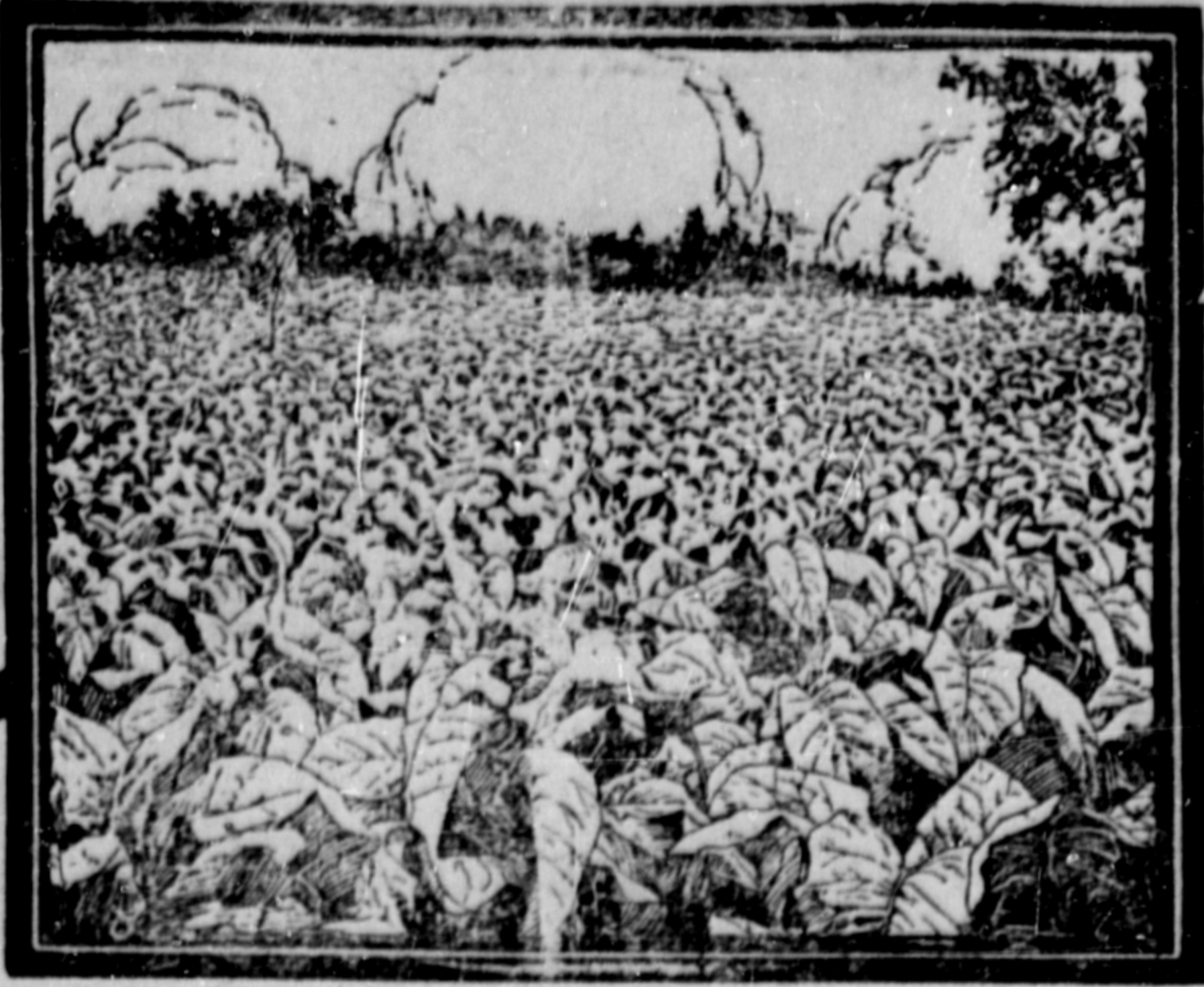
TOBACCO SERIES No. 1

Drawing from an actual photograph of a typical Tobacco field in the "Old Belt" (Virginia and North Carolina).