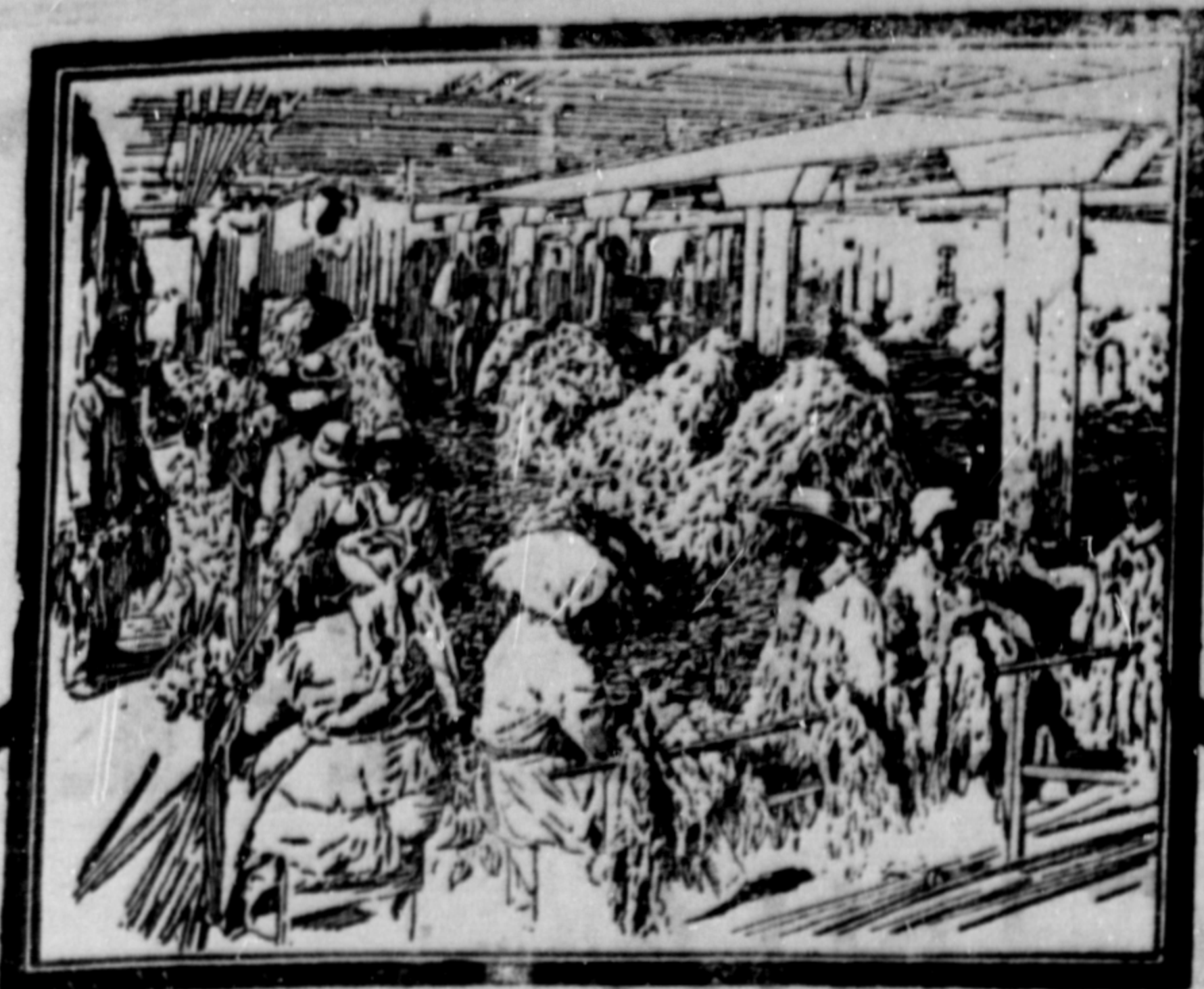
TOBACCO SERIES No. VI View of Sorting Room in Virginia Re-drying Plant. The leaf being sorted into different grades of quality prior to re-drying before export.

The "Heart" is the guarantee of quality.