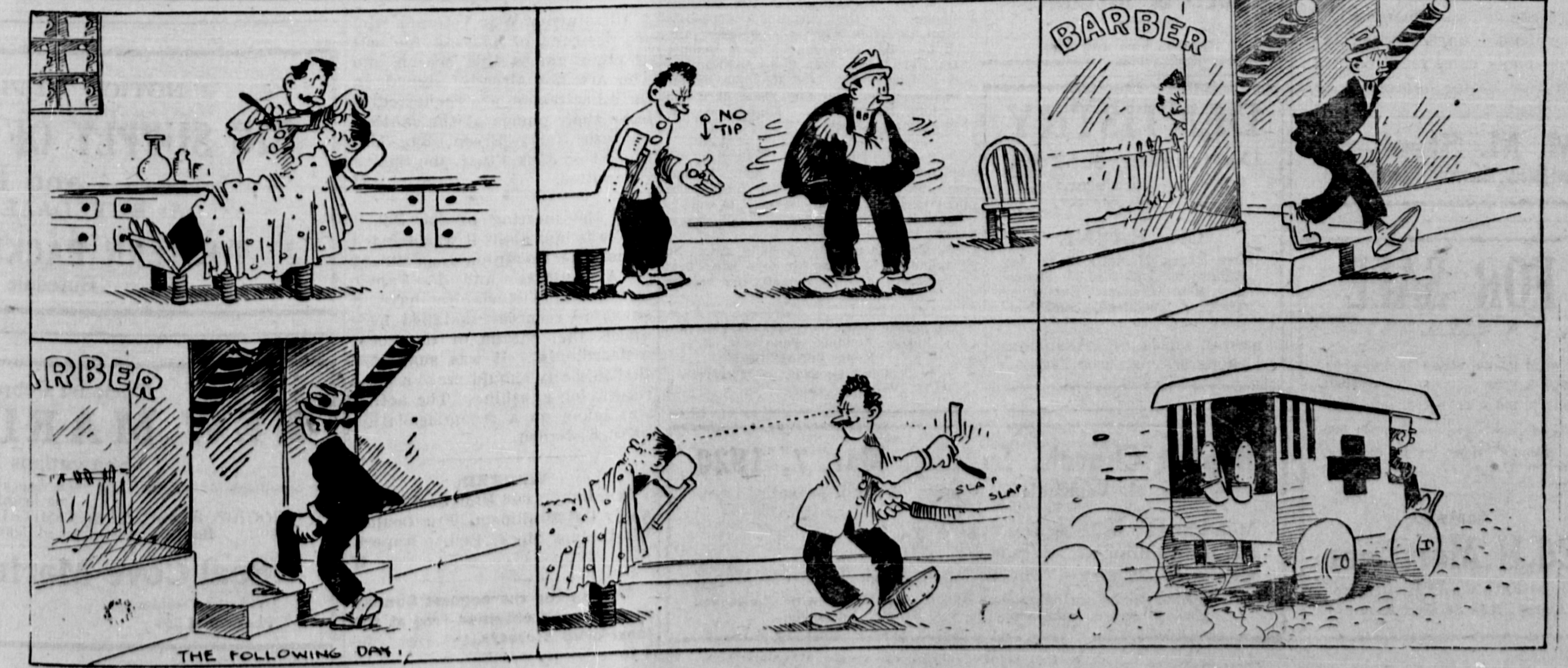
THE FOLLOWING DAY.