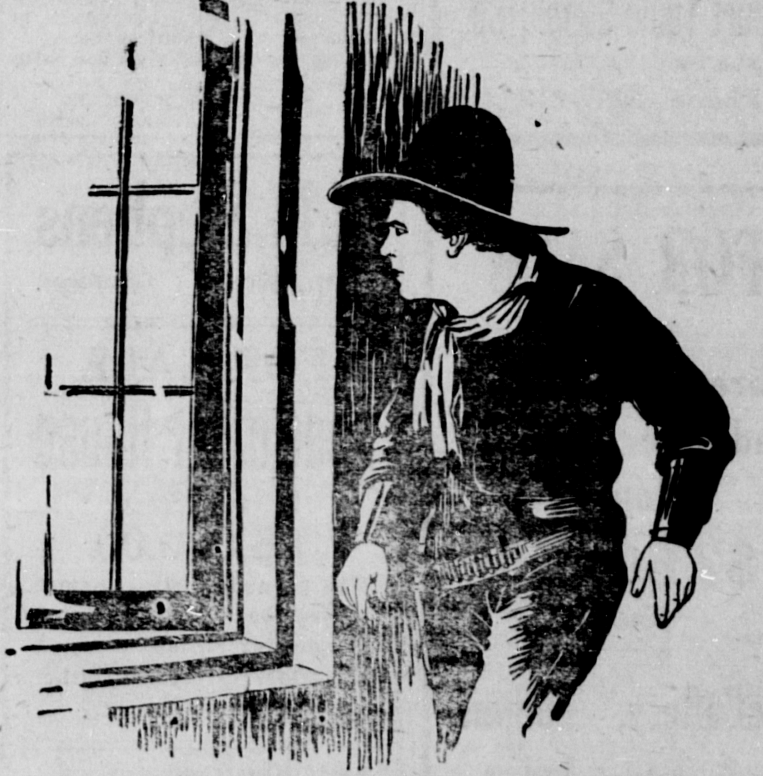
WM. FARNUM in "THE LONE STAR RANGER" at the Westholme Tonight and Tomorrow