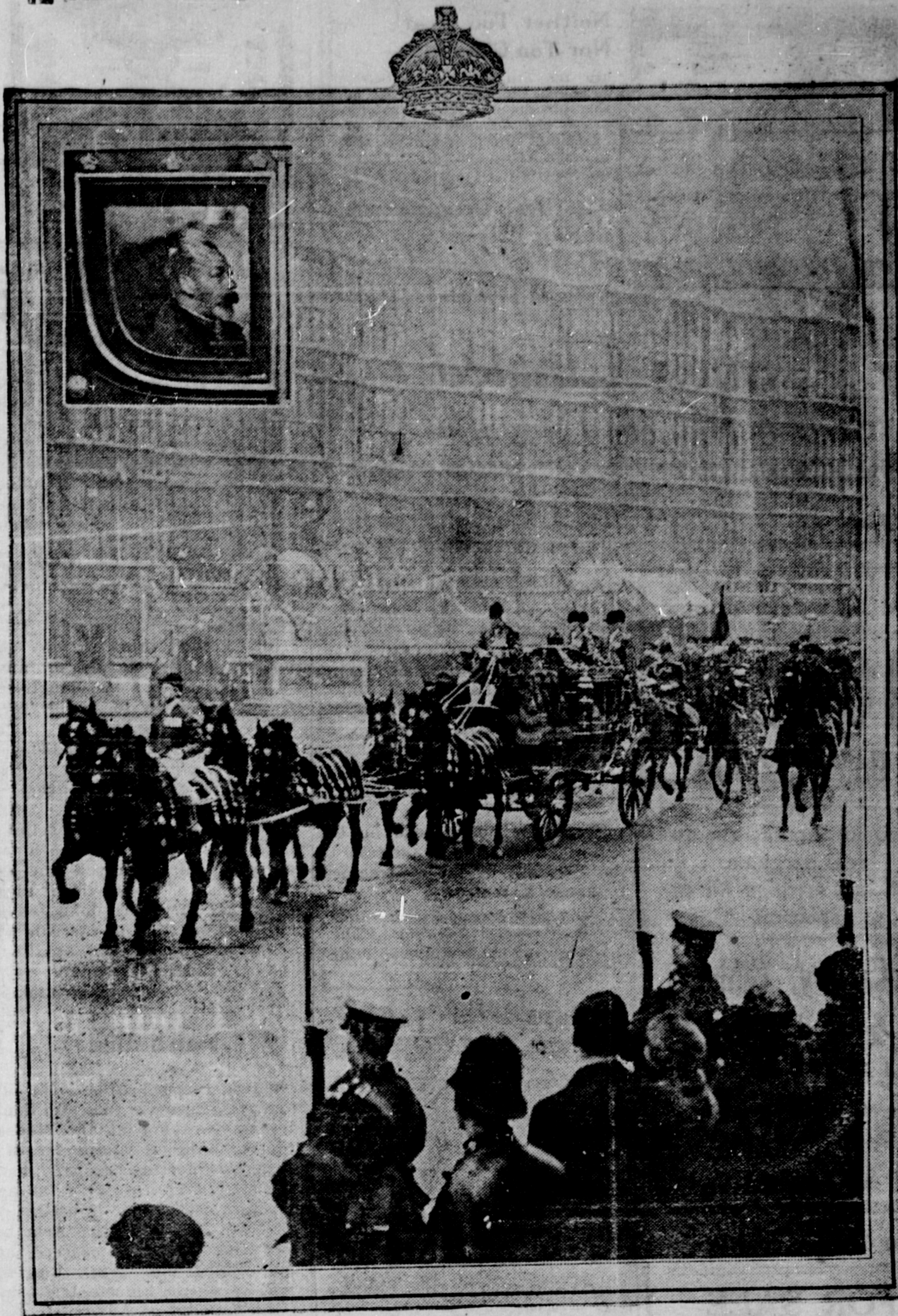
On a blustery day, typical of this present winter, the King, accompanied by the Queen of England, opened Parliament in state. The admirably worded speech from the throne was of exceptional interest. A snapshot photograph of the King in the royal carriage is shown in the insert.