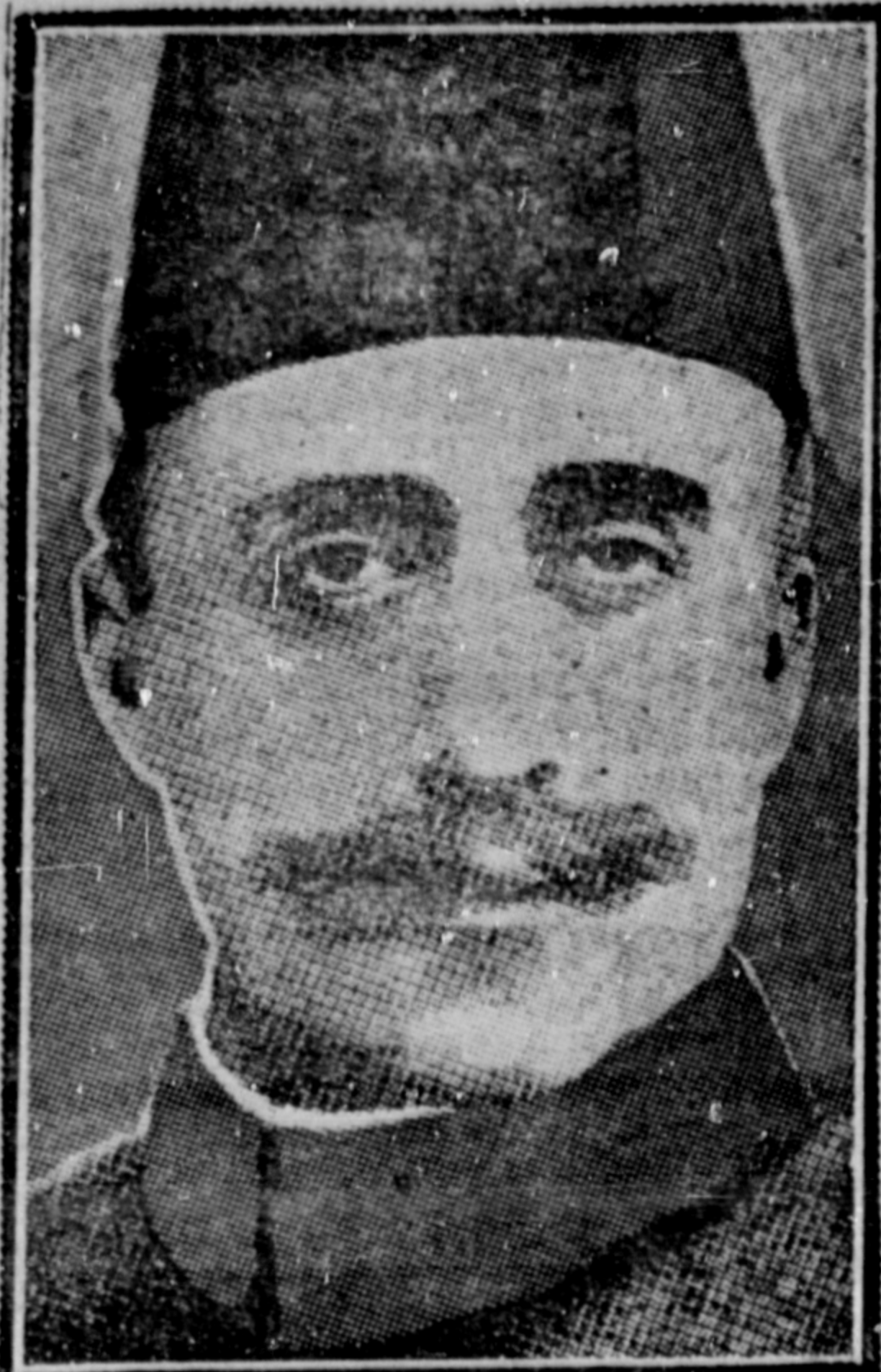
PRINCE YUSUP IZZED-DIN

Nominated as regent of Turkey owing to the illness of the Sultan. The appointment is opposed.