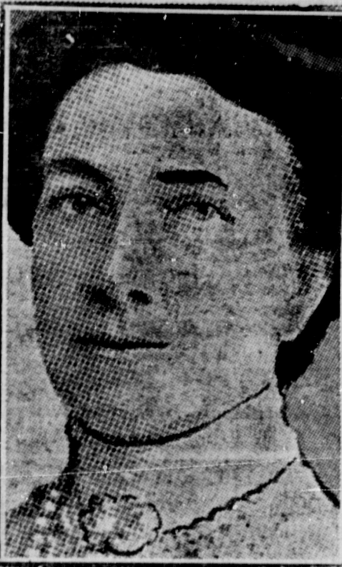
QUEEN VICTORIA, OF SWEDEN

Canadian poet travelling in the war zone at the outbreak of war who is now driving a motor transport in the French army.