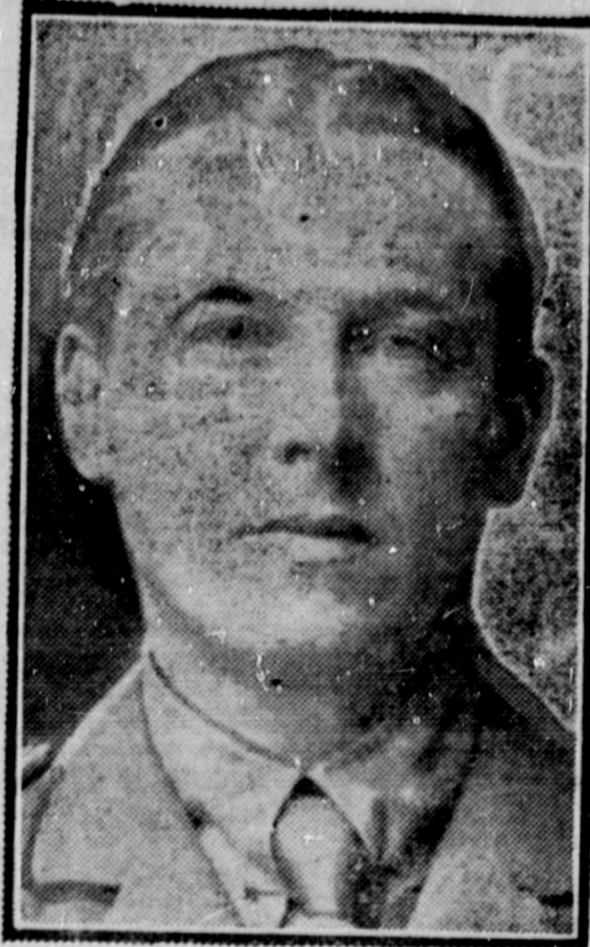
ROBERT W. SERVICE

50c. a box, 6 for $2.50, trial size, 25c. At all dealers or sent postpaid by Fruit-a-tives Limited, Ottawa.