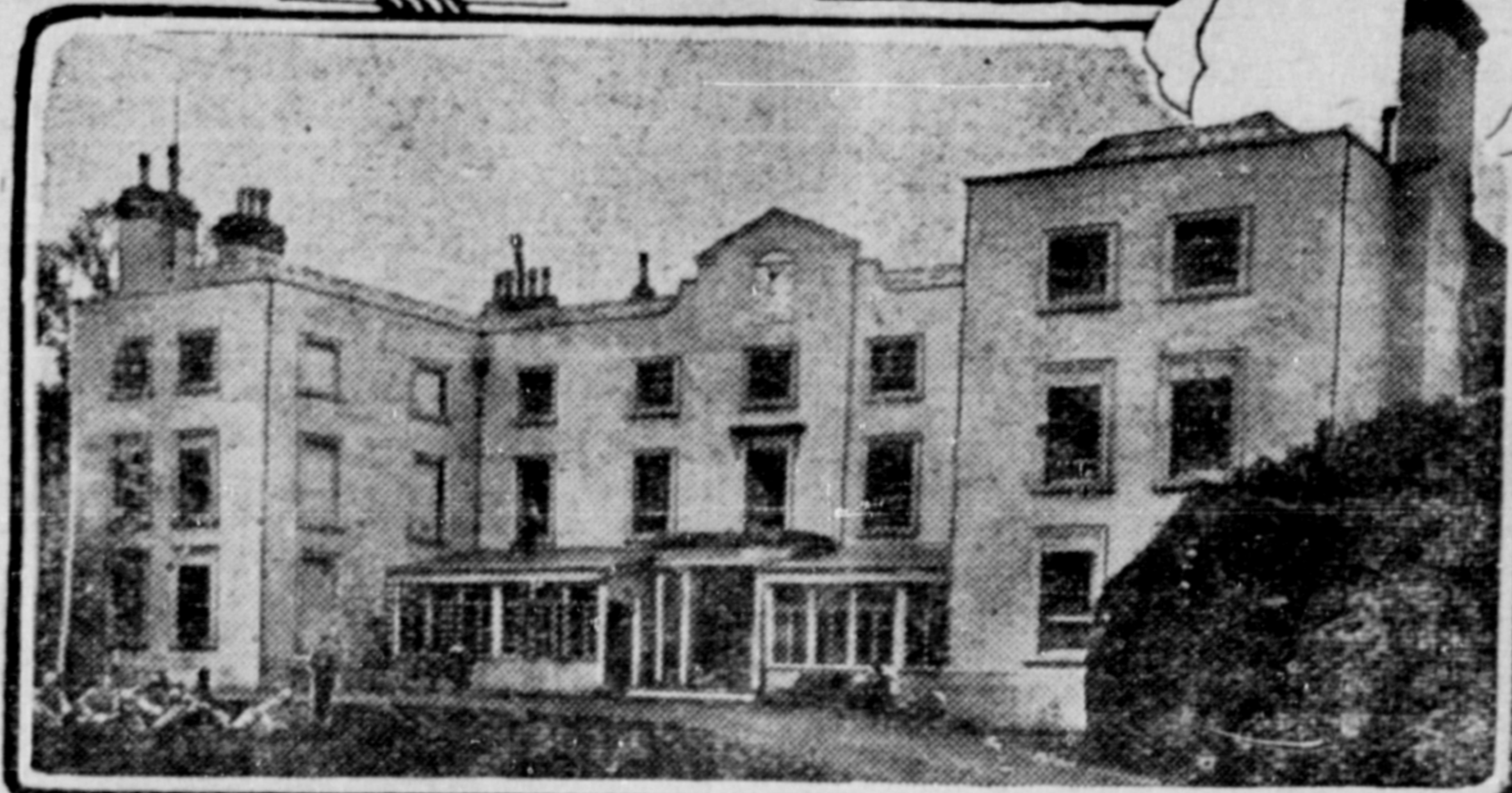
Queen's Canadian Military Hospital, Beachborough, Near Folkestone

Follow the crowd to Self's Cafe. There is a reason. Next Majestic Theatre. 1024f.