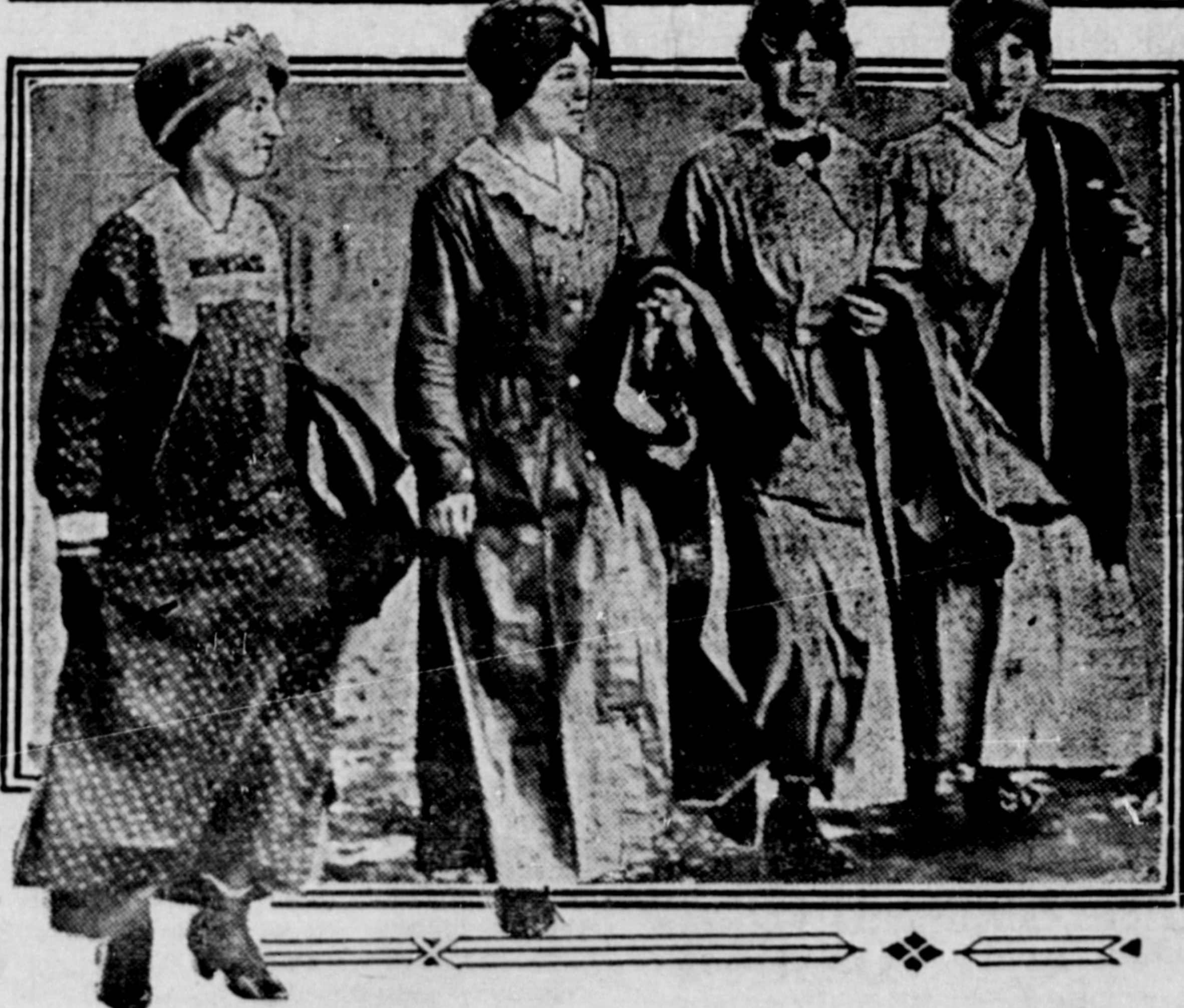
Upper picture shows Viscountess Supplin seated at her desk "enlisting" women volunteer workers for manufacturing war munitions, after the monster parade in London in which 50,000 women participated. The lower picture shows a group of ladies near Vickers' works just before the beginning of their day shift.