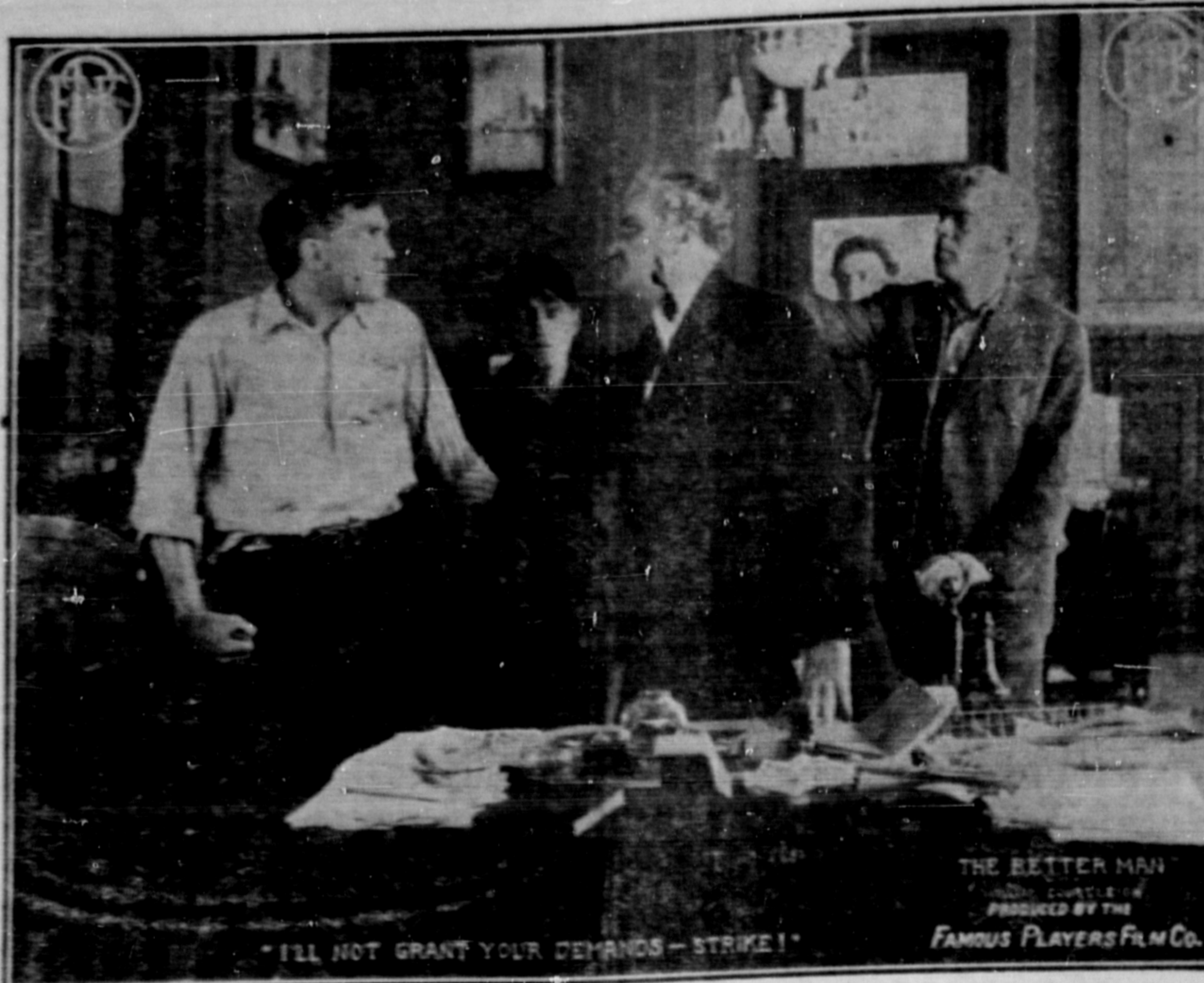
SCENE FROM "THE BETTER MAN"

A very fine Paramount drama showing at the Majestic Theatre on Wednesday and Thursday.