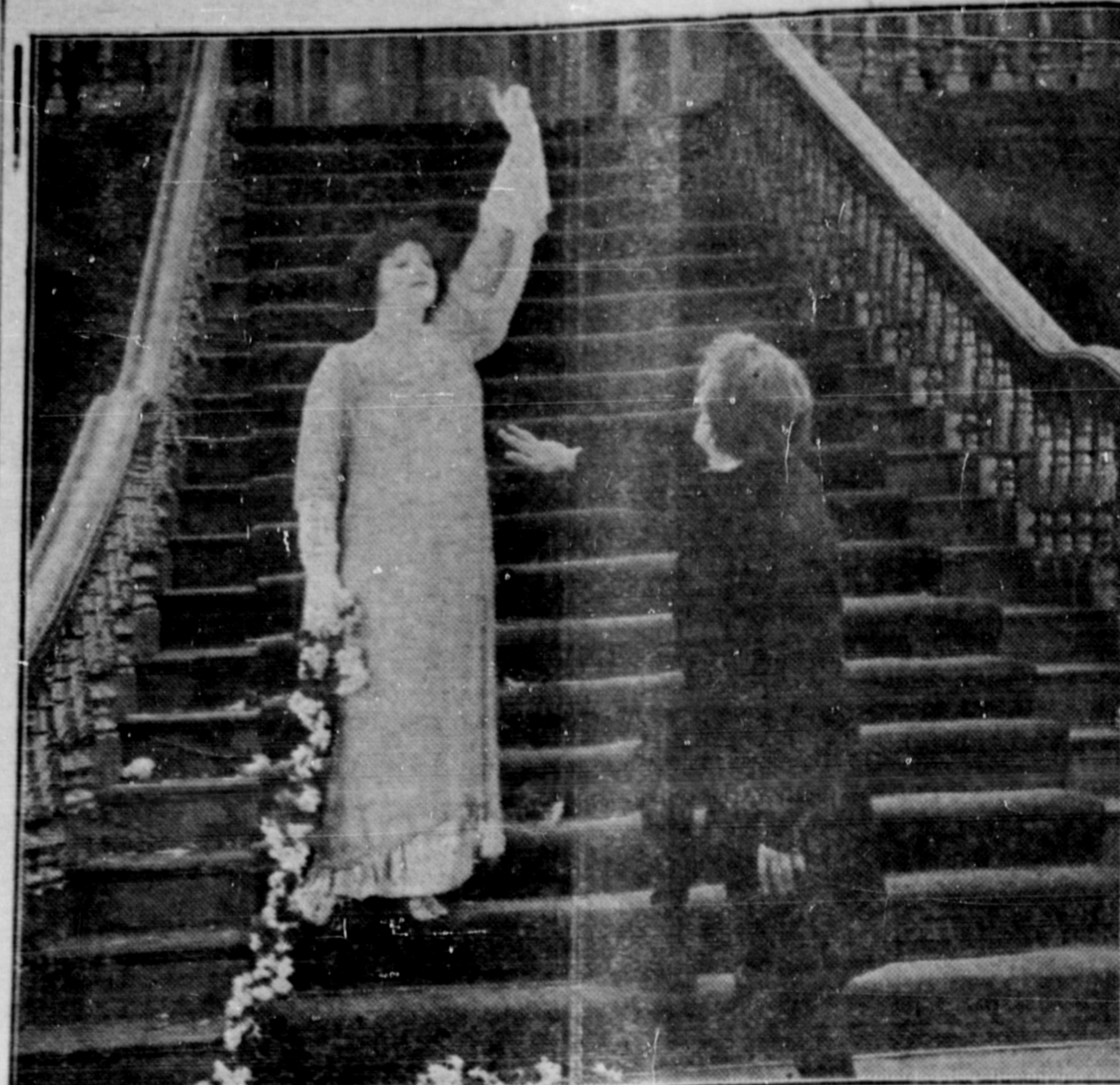
SCENE FROM "THE DANCING GIRL."

which is being shown at the Westholme tonight.