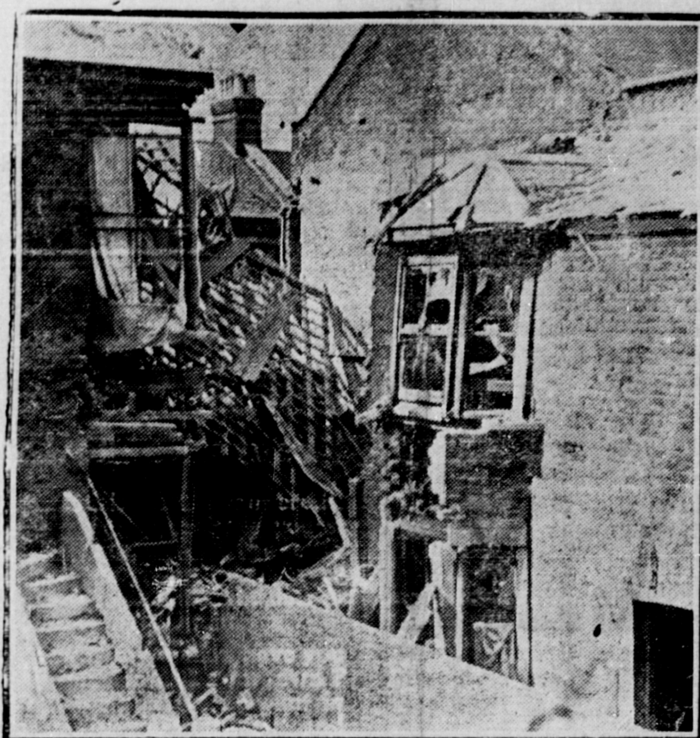
THE ZEPPELIN RAID HITS ONE HOUSE

No Reply. Petrograd, Oct. 6.—At noon Bulgaria had not replied to the Russian ultimatum.