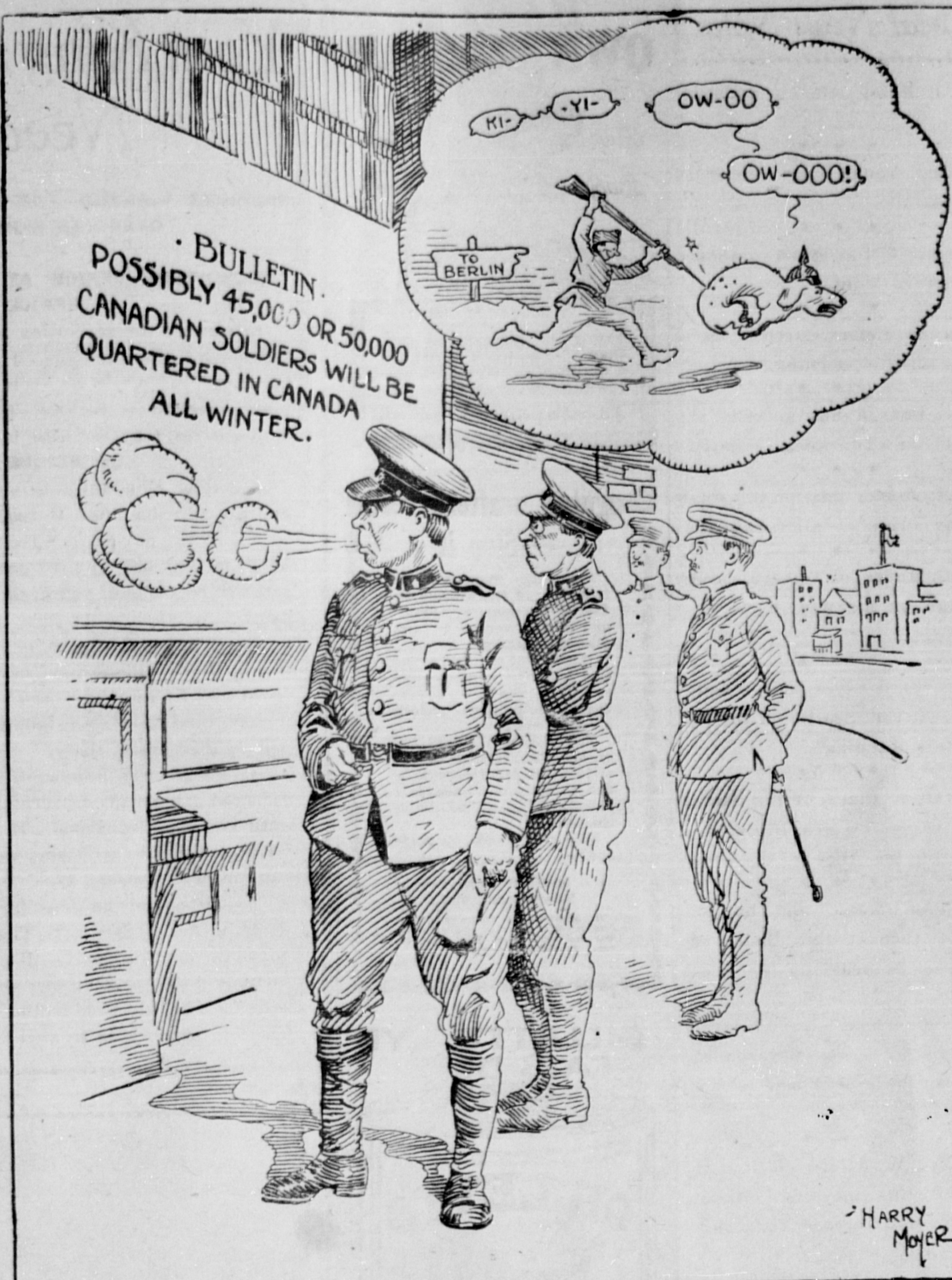
"HUMPH! AND US EXPECTIN' TO SPEND THE WINTER HUNTIN' IN EUROPE"

2nd Avenue Close to the Westholme Theatre CENTRALLY LOCATED STRICTLY MODERN RENTS REASONABLE Weekly or Monthly by Arrangement UNDER NEW MANAGEMENT