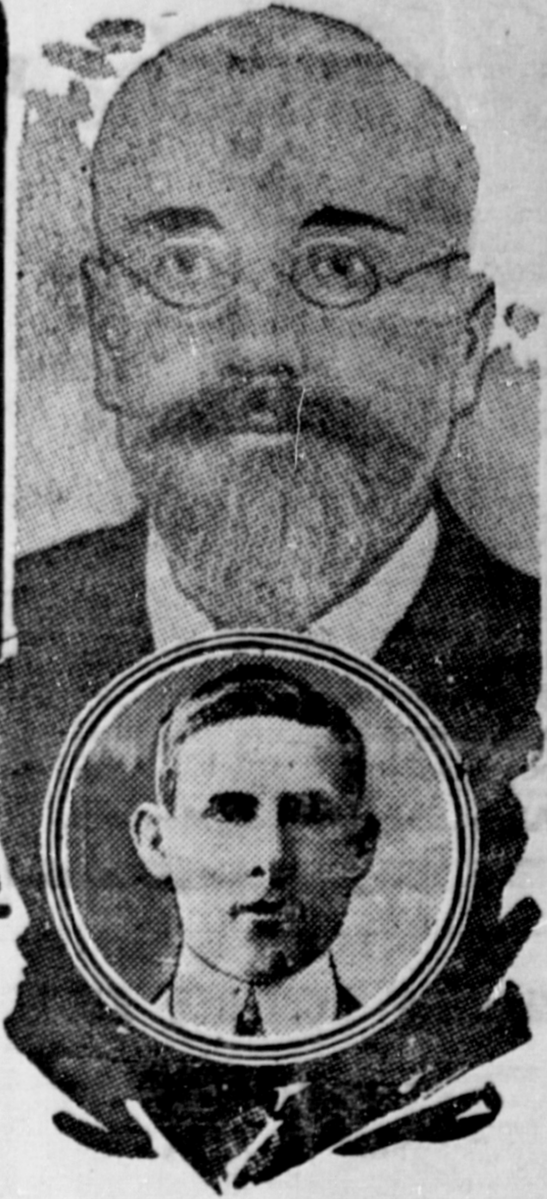
PREMIER VENIZELOS AND CROWN PRINCE GEORGE