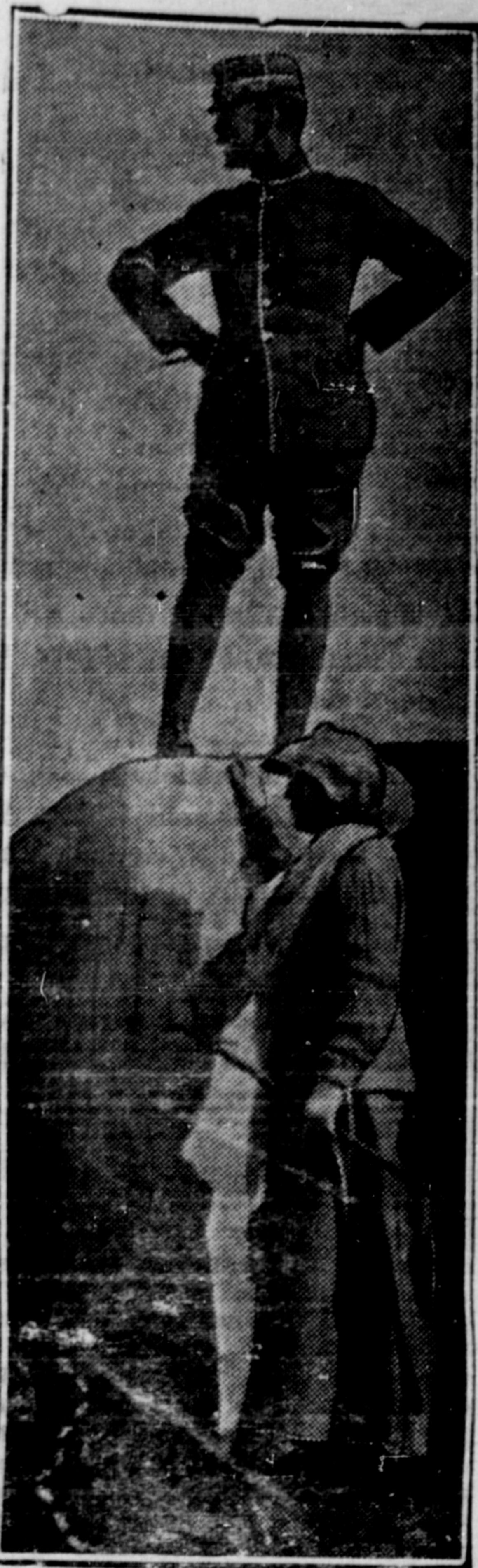
Greek King Still Up in Air.

The Germans, who pride themselves on their business methods, have given Krupp's a free hand in furnishing the armaments of the German warships. There has been practically no competition whatever, and the result is that German warships, class by class, are about the most feebly-armed in the world. The Krupp firm is the embodiment of German militarism. In the Tagliche Rundschau, the Neueste Nachrichten, and a half dozen other newspapers owned by the company, the future of Germany at sea has been painted in the most glowing colors, and all the time the German navy has been palmed off by this same firm with guns which other nations had abandoned years before as obsolete.