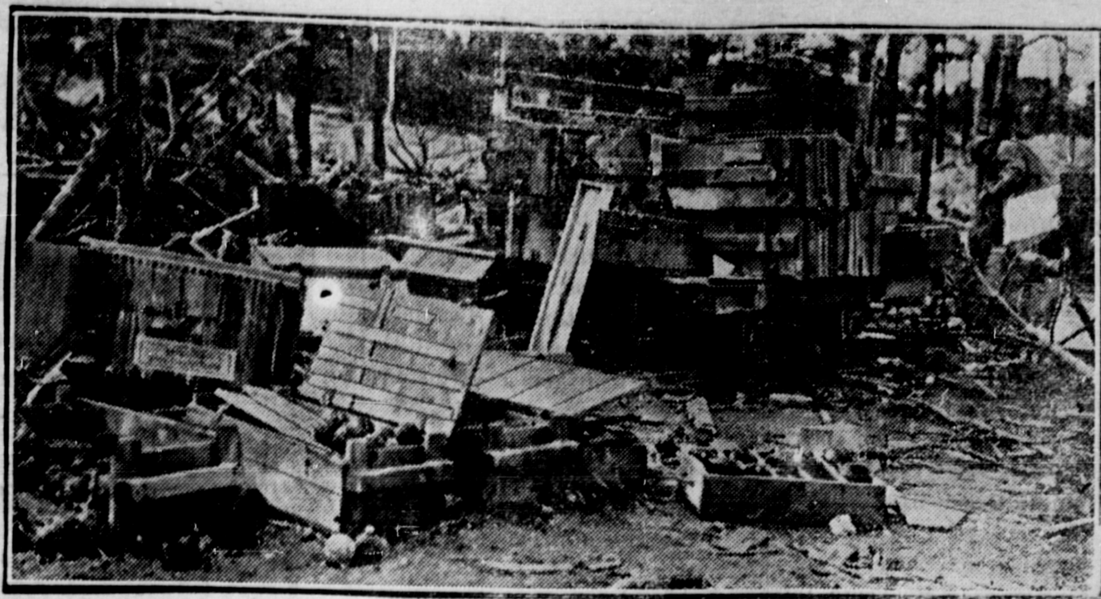
WAR'S MOST TERRIBLE ENGINES. —Photo shows collection of deadly hand grenades containing chlorine gas captured from the Germans recently.