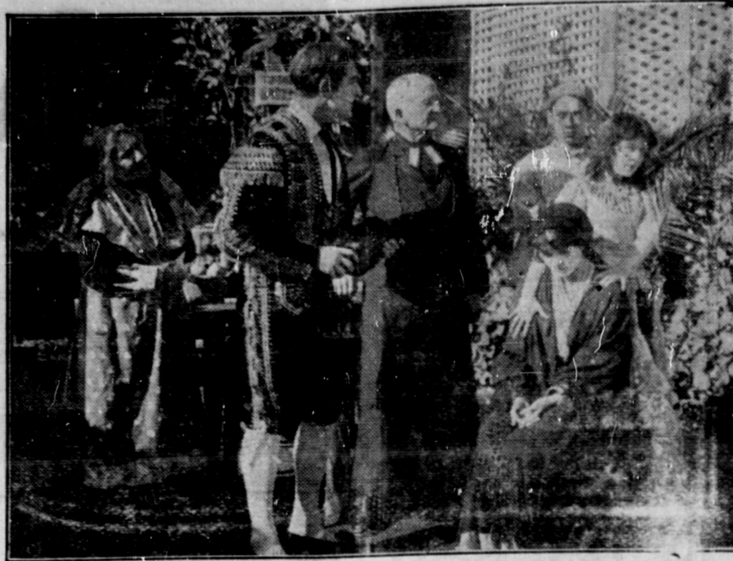
Above is a scene from "The Pretty Sister of Jose" at the Westholme Theatre Tonight.

The more talk it takes to run things the slower they move.