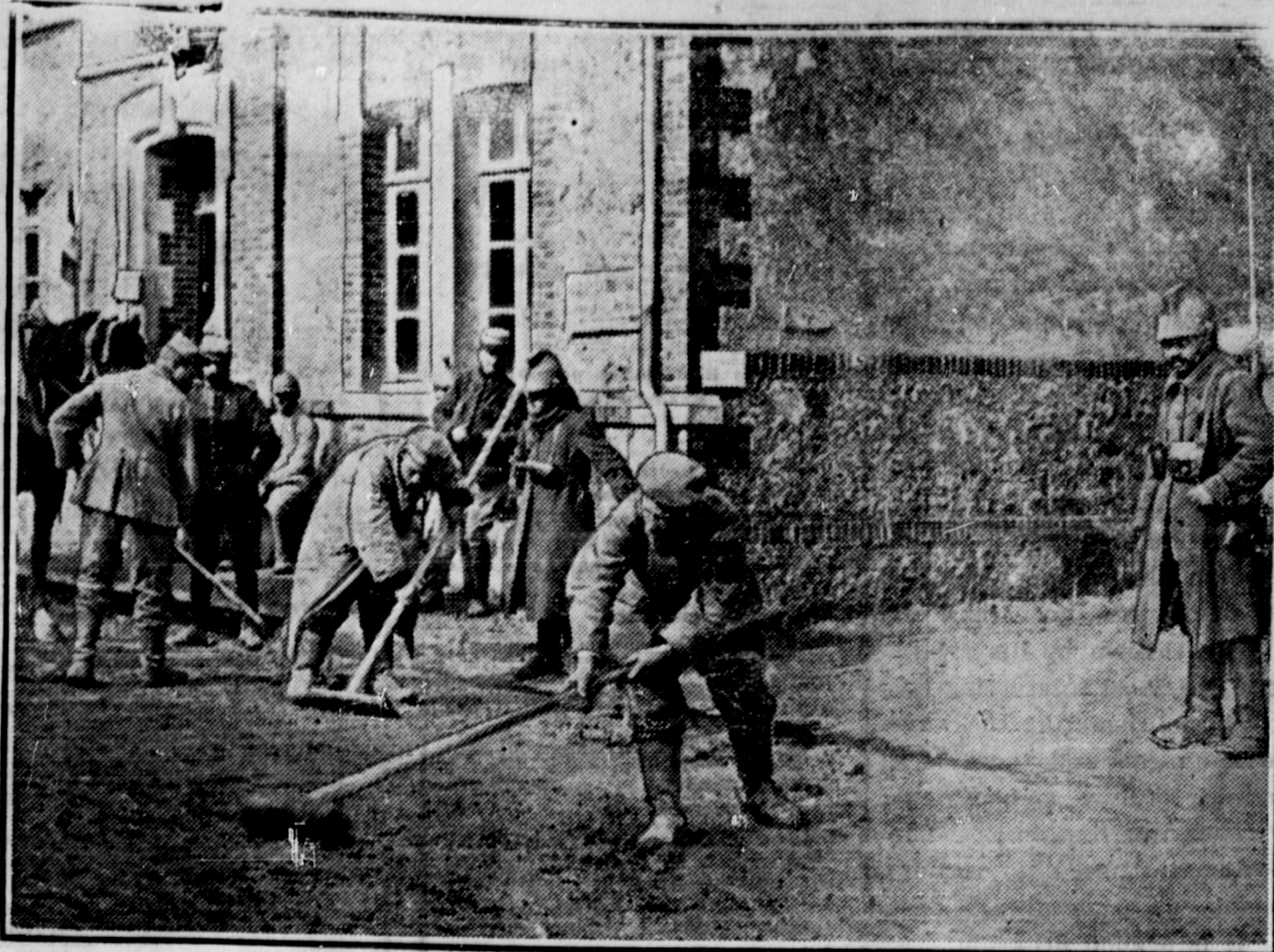
GERMAN PRISONERS CLEANING AND MENDING ROADS IN FRANCE.—A safer job than they had when in the trenches.

Ship your FREE FURS Our Trappers Guide Supply Catalog and Price List. Write today, address JOHN HALLAM LIMITED TORONTO