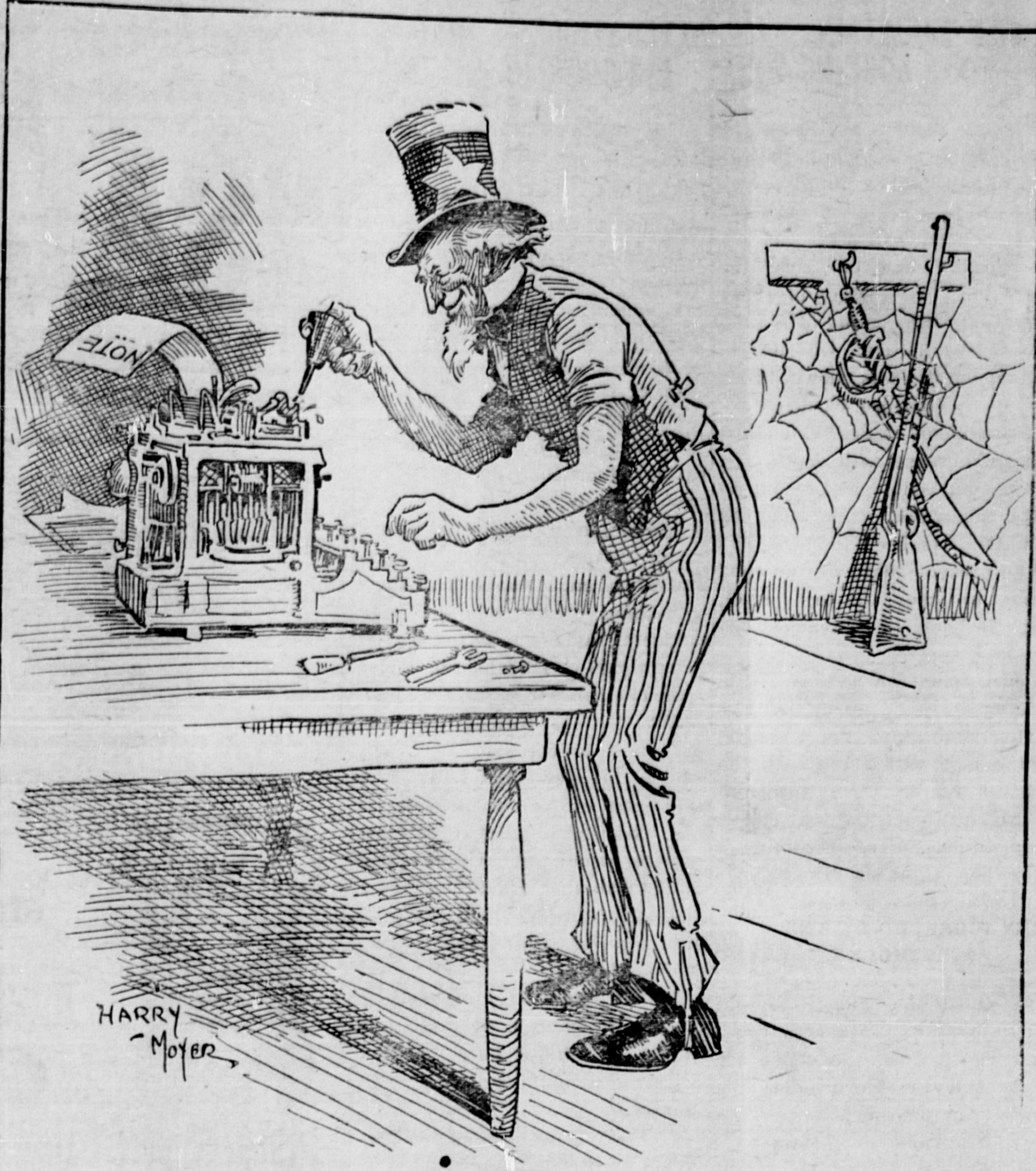
"HIS FAVORITE WEAPON" —Cartoon by Moyer.

Subscribe for the Daily News. Fifty cents per month.