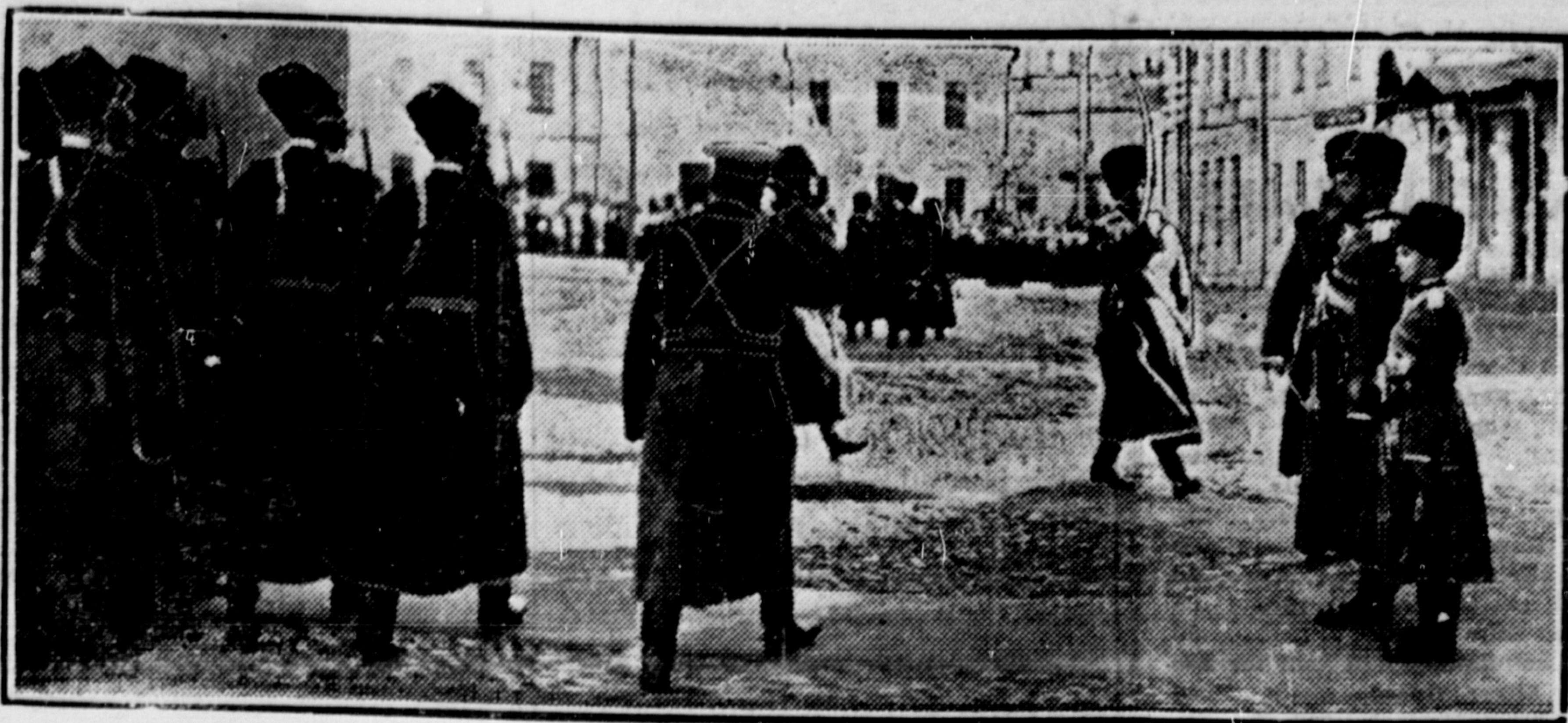
THE CZAR TAKES SUPREME COMMAND OF HIS FORCES.—Latest photo of the Russian monarch to reach America shows the Czar of all the Russians returning the salute, while his son stands at attention at his side during a recent review of one of his armies.