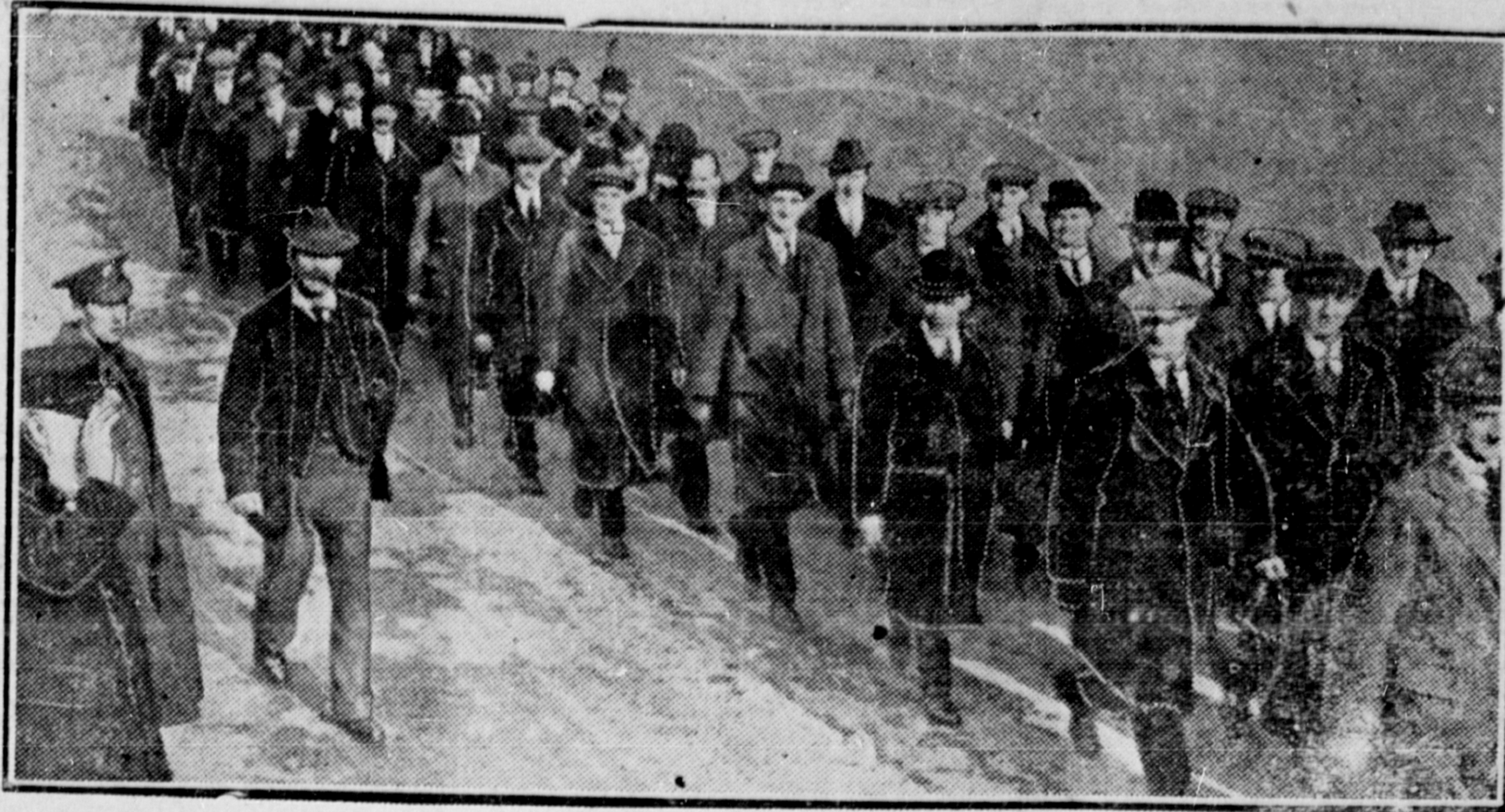
"DERBY VOLUNTEERS" WHO HAVE JUST SIGNED.—Photo shows a day's yield of recruits under the Derby campaign which expired November 30th. Though unexpected success has been attained along the lines followed in this campaign, yet the question of conscription is still alive.