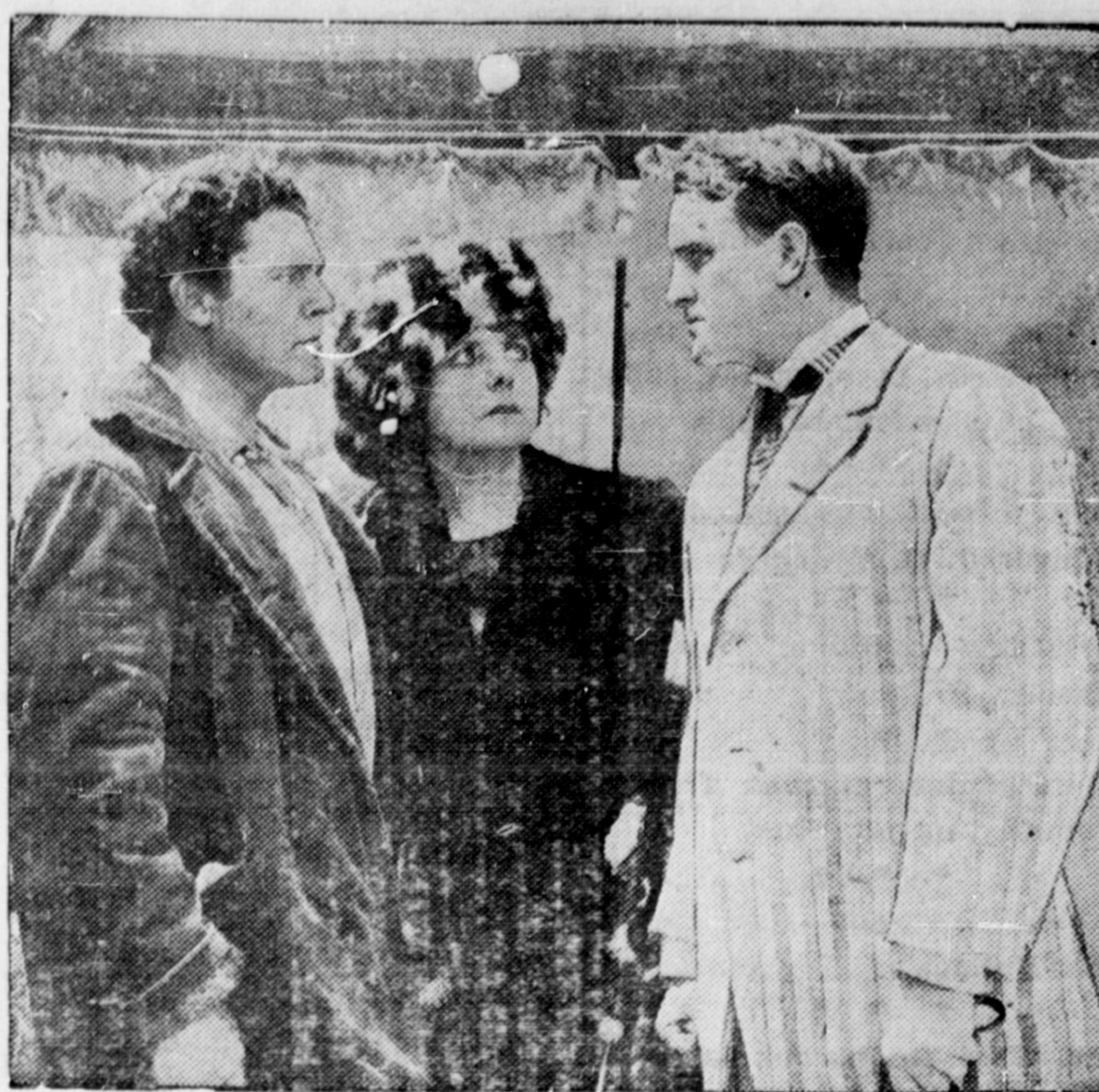
Scene from "The Spoilers" showing at the Westholme tonight.

Provincial and Dominion Land Surveyor Surveying and Engineering P. O. Box 10 Phone 85 Fourth Street