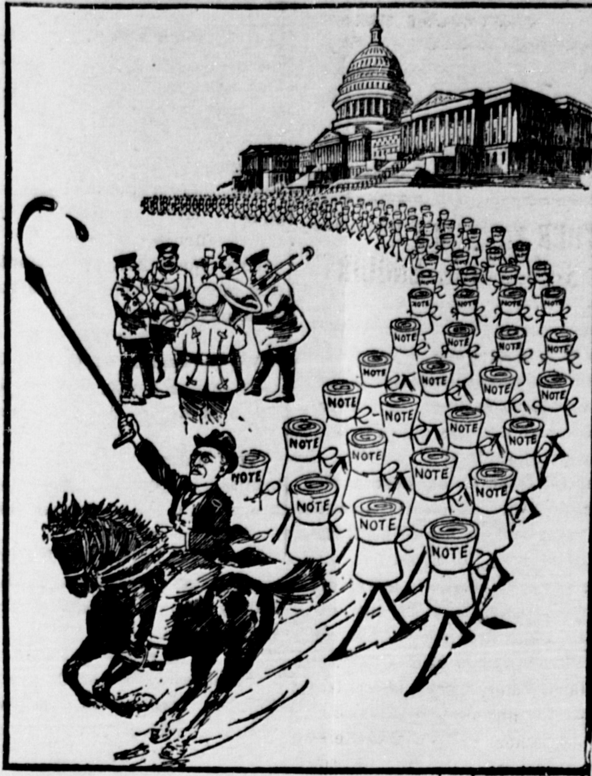
"WILSON'S ARMY"—Cartoon from London Bystander.

I still have quite a few pairs of felt and wool slippers left which must be closed out. Extra special reductions. Peck the Shoeman.